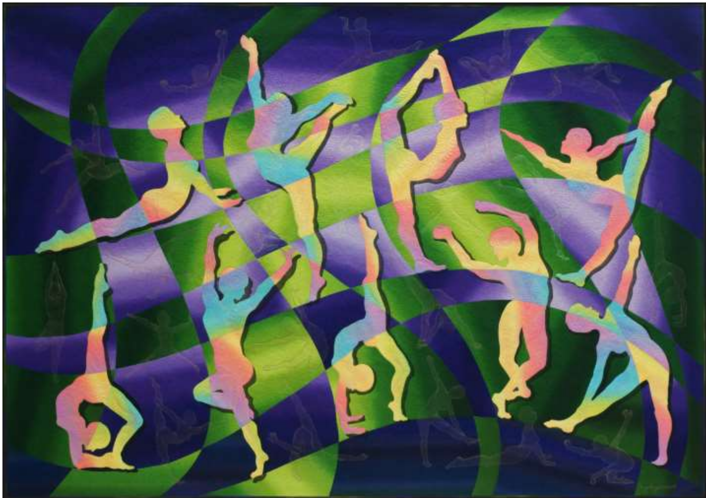
Checks & Balances #1 • 65" x 93" • Copyright © 2010 Caryl Bryer Fallert • Bryerpatch Studio • www.bryerpatch.com

Bryerpatch Studio • 10 Baycliff Pl. • Port Townsend, WA 98368 • caryl@bryerpatch.com • www.bryerpatch.com