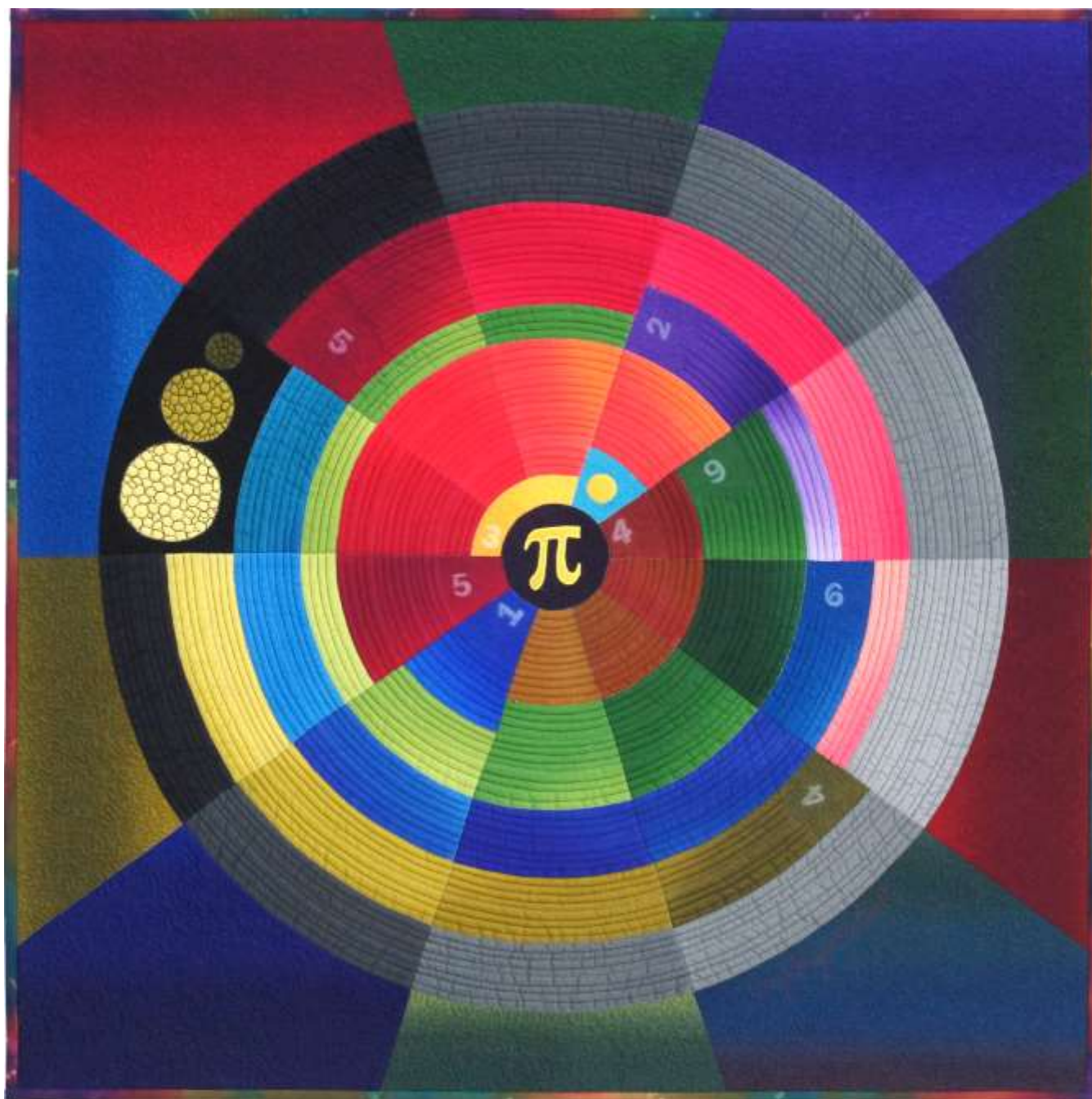
Pi in the Rye • 30" x 30" • Copyright © 2011 Caryl Bryer Fallert • Bryerpatch Studio • www.bryerpatch.com

Bryerpatch Studio • 10 Baycliff Pl. • Port Townsend, WA 98368 • caryl@bryerpatch.com • www.bryerpatch.com