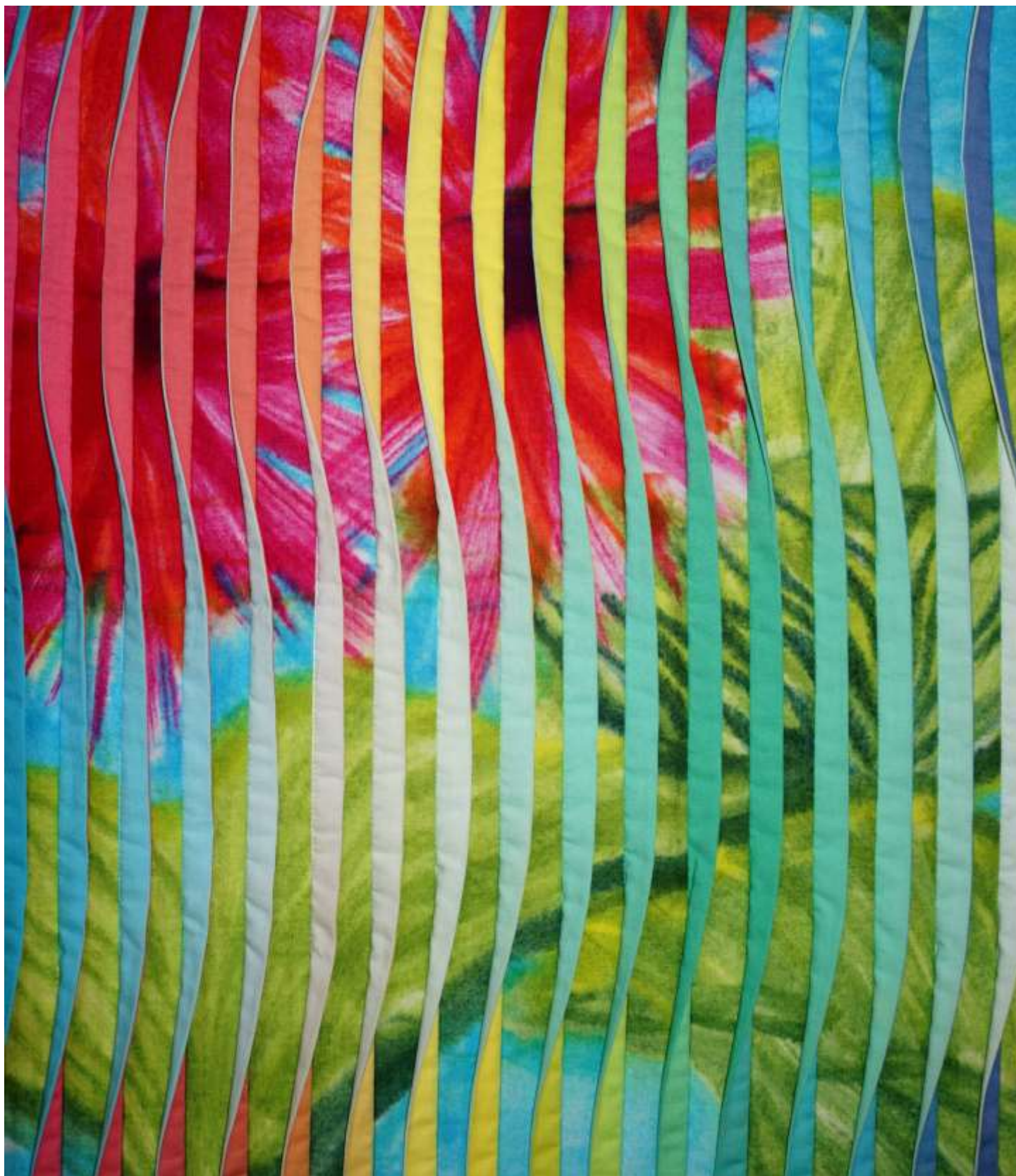
Reflection #18 (detail) • 51" x 63" • Copyright © 1991 Caryl Bryer Fallert