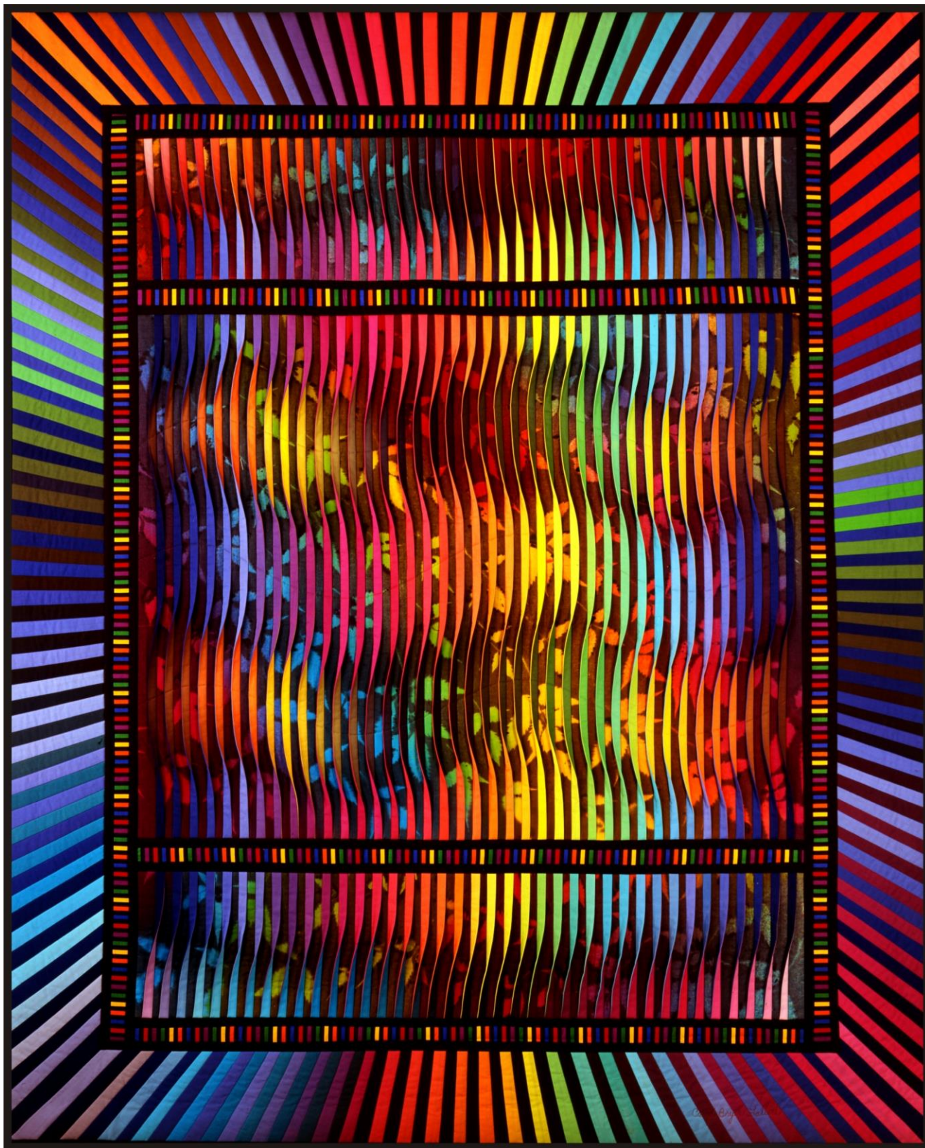
Reflection #27 • 67" x 54" • Copyright 1992 Caryl Bryer Fallert • Bryerpatch Studio • www.bryerpatch.com

Bryerpatch Studio • caryl@bryerpatch.com • www.bryerpatch.com