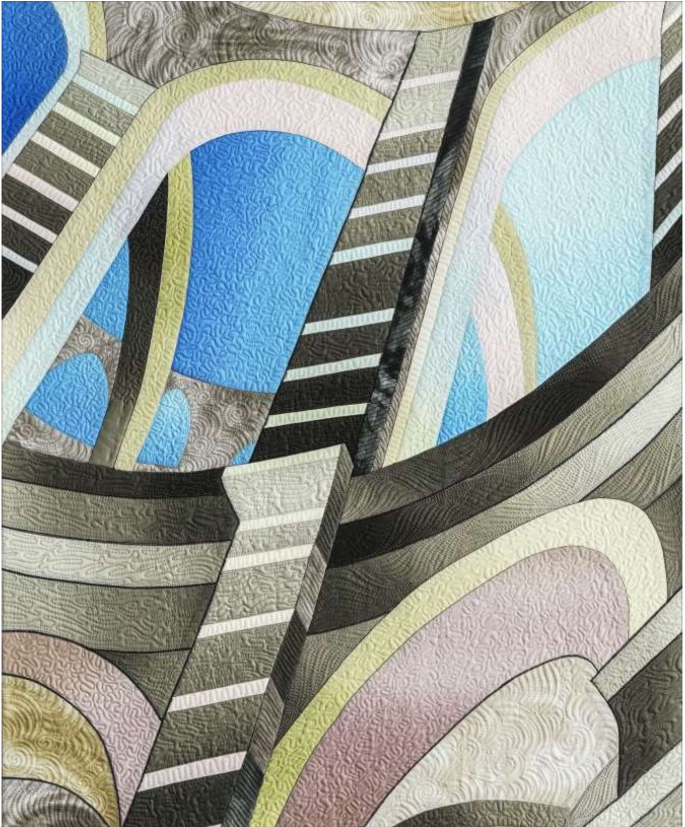
Arches • 44" x 44" • Copyright © 2017 Caryl Bryer Fallert-Gentry • Bryerpatch Studio • www.bryerpatch.com