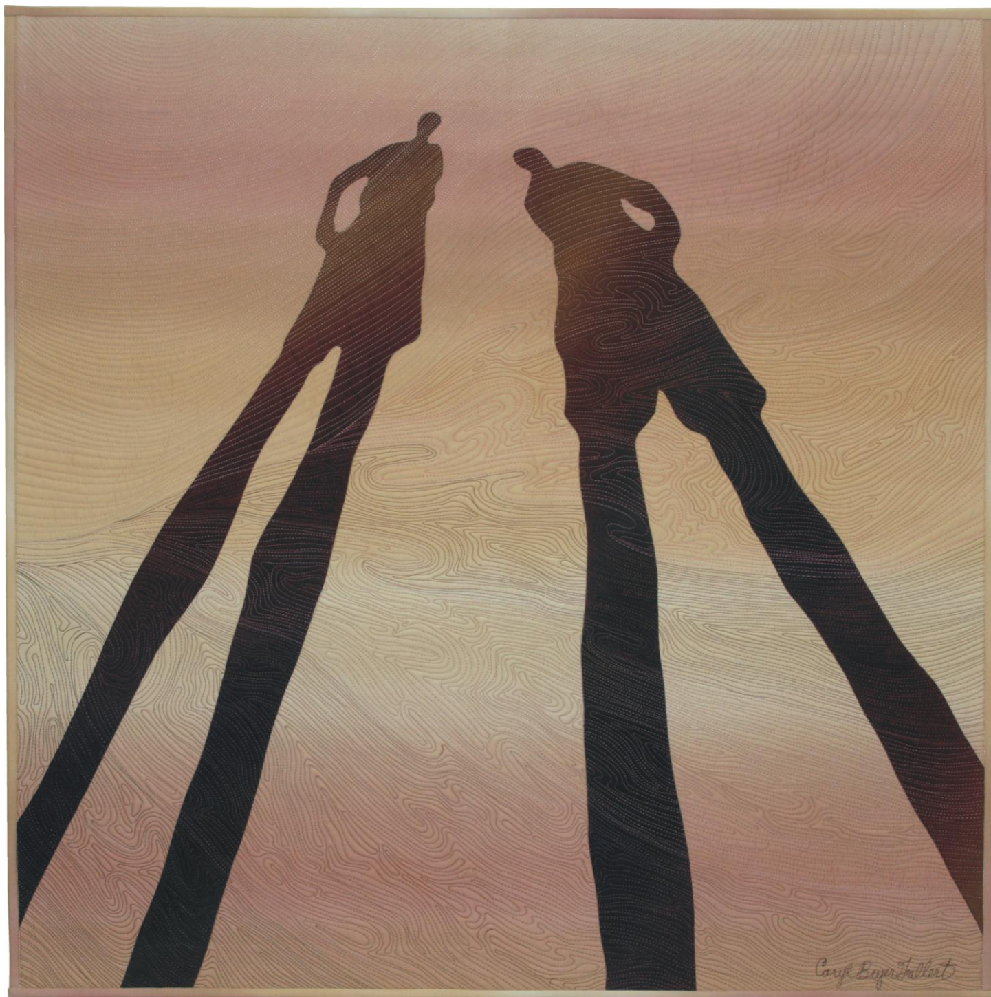
Casting a Long Shadow #1 • 30" x 30" • Copyright © 2010 Caryl Bryer Fallert • Bryerpatch Studio • www.bryerpatch.com