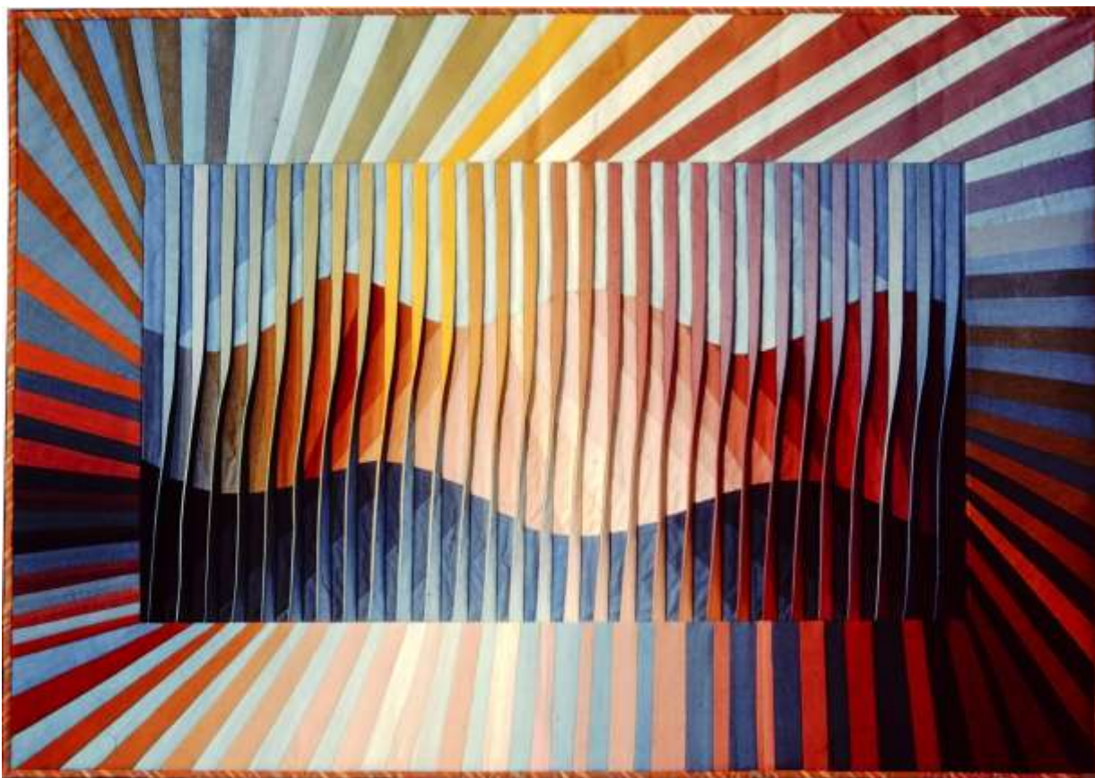
Coastal Range #1 • 27" x 40" • Copyright 1988 Caryl Bryer Fallert • www.bryerpatch.com

Bryerpatch Studio • 10 Baycliff Pl. • Port Townsend, WA 98368 • caryl@bryerpatch.com • www.bryerpatch.com