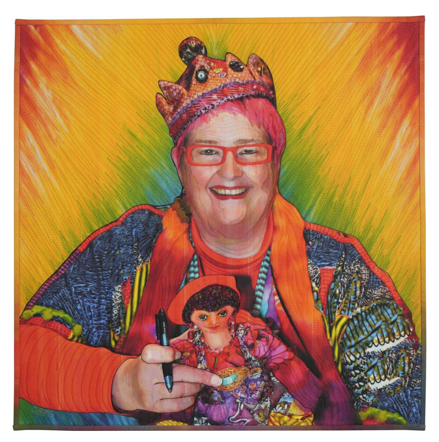
Eleanor • 24" x 24" • Copyright © 2024 Caryl Bryer Fallert-Gentry • <u>www.bryerpatch.com</u>

Bryerpatch Studio • 10 Baycliff Pl. • Port Townsend, WA 98368 • caryl @bryerpatch.com • www.bryerpatch.com