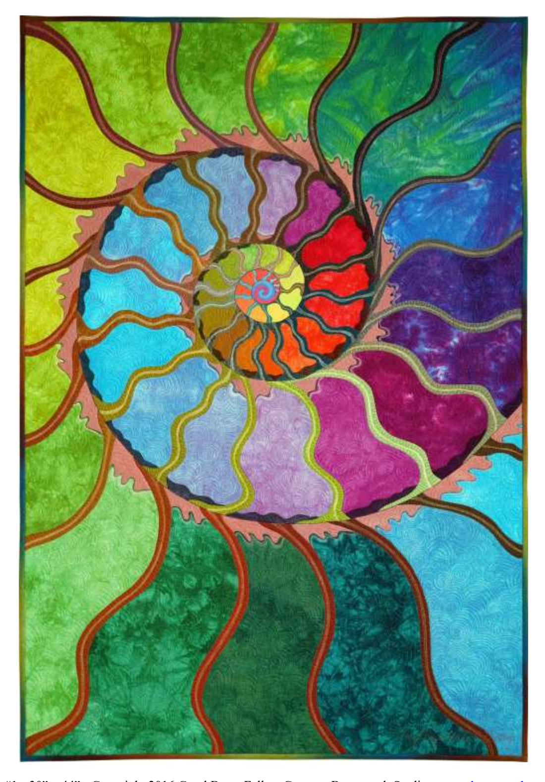
Fossil Fantasy #1 • 30" x 44" • Copyright 2016 Caryl Bryer Fallert-Gentry • Bryerpatch Studio • www.bryerpatch.com