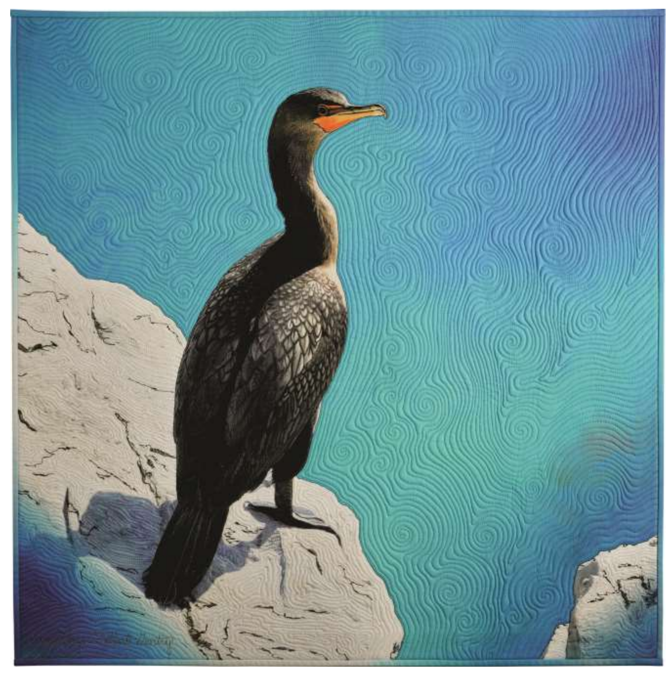
Gaspe Cormorant • 30" x 30" • Copyright © 2023 Caryl Bryer Fallert-Gentry • www.bryerpatch.com