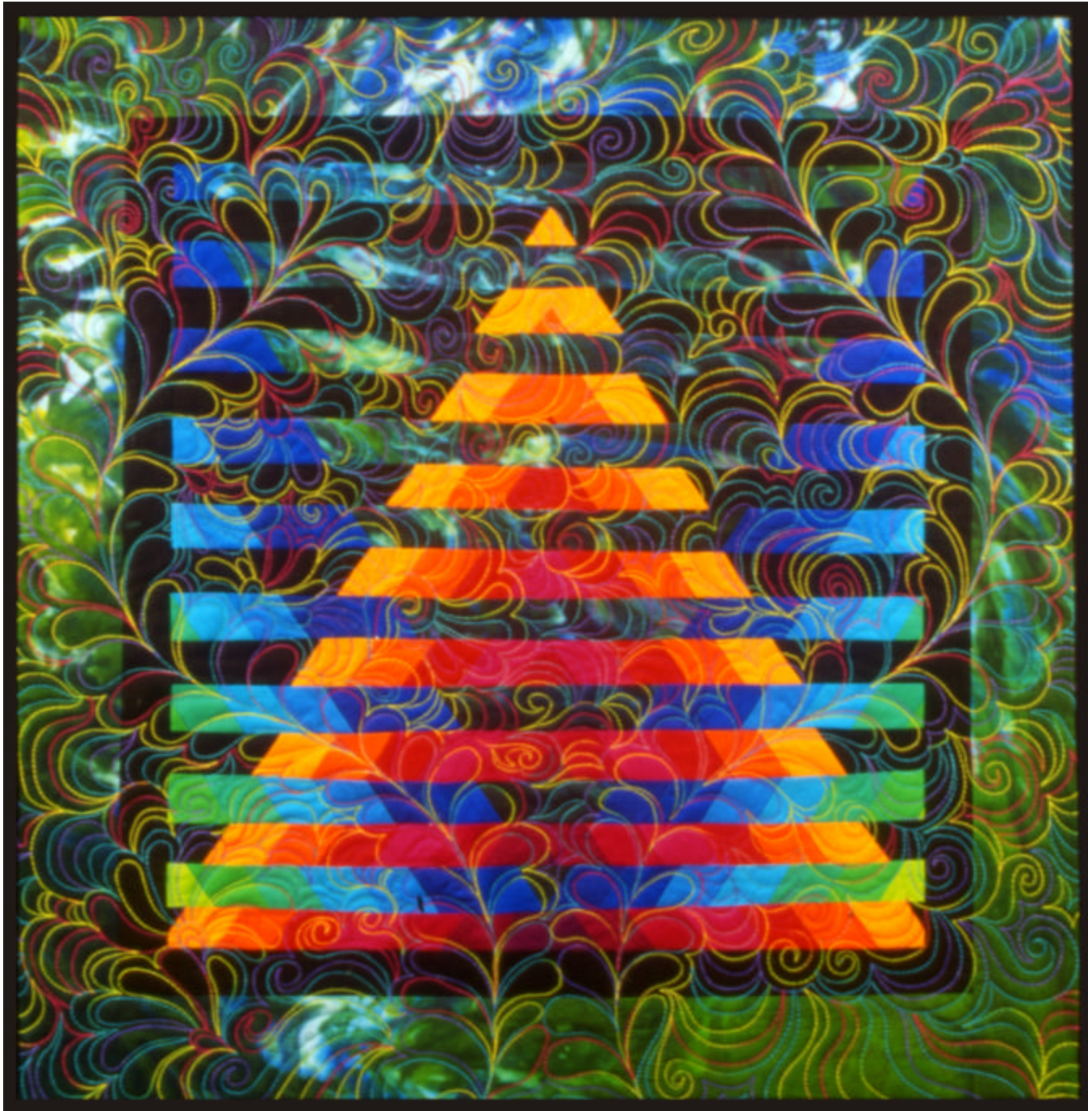
Illusion #16 • 24" x 24" • Copyright © 1996 Caryl Bryer Fallert • Bryerpatch Studio • www.bryerpatch.com