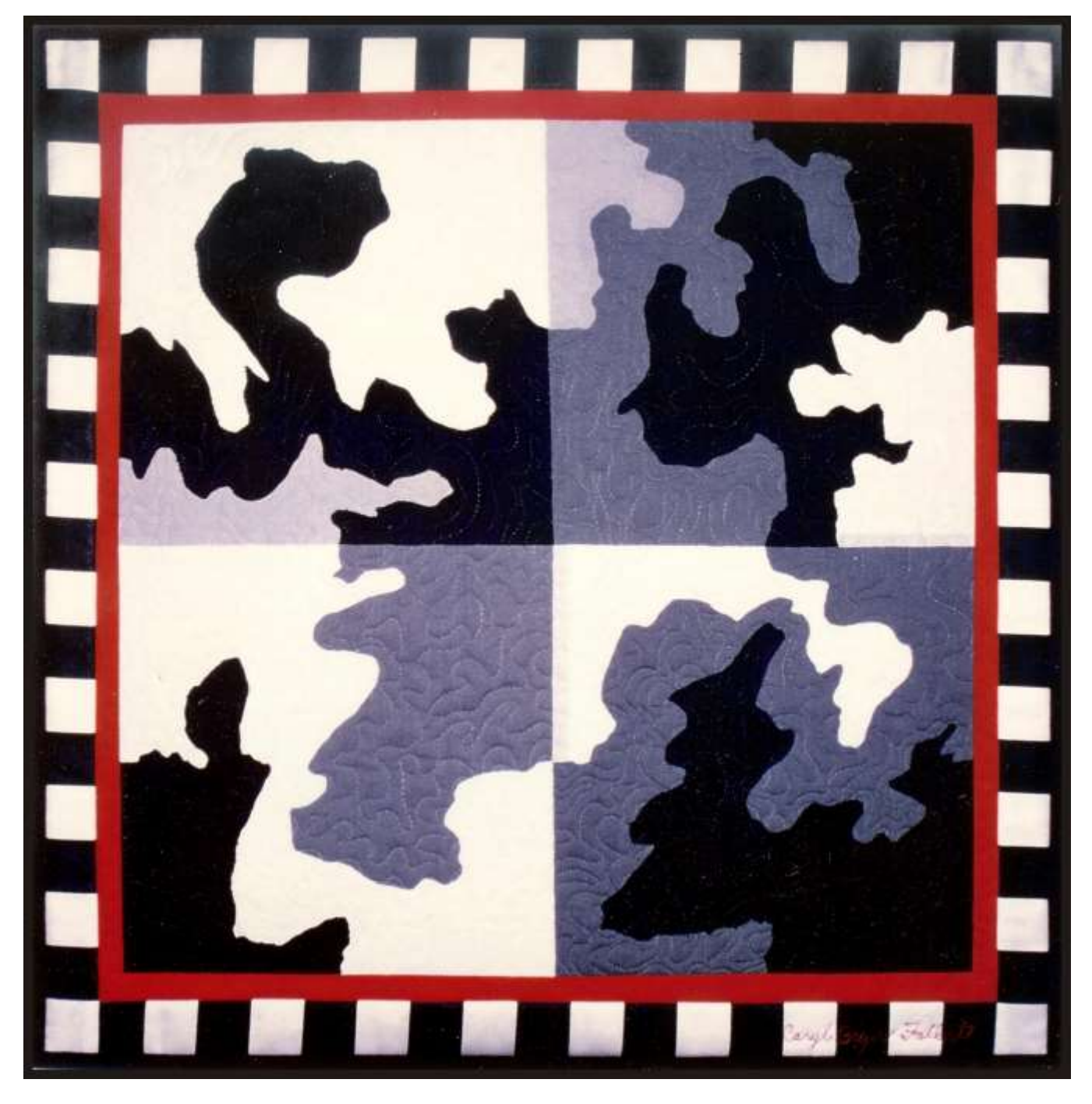
Magma #1 • 19" x 19" • Copyright © 1992 Caryl Bryer Fallert • www.bryerpatch.com