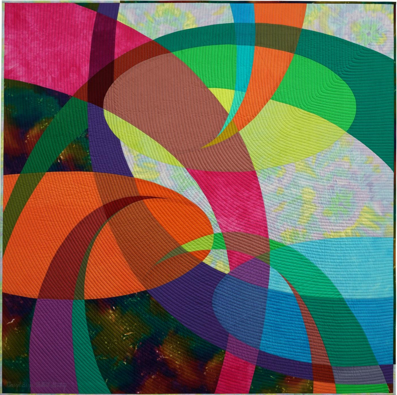
Parabollipses • 49" x 49" • Copyright © 2016 • Caryl Bryer Fallert-Gentry • Bryerpatch Studio • www.bryerpatch.com

Bryerpatch Studio • 10 Baycliff Pl. • Port Townsend, WA 98368 • caryl@bryerpatch.com • www.bryerpatch.com