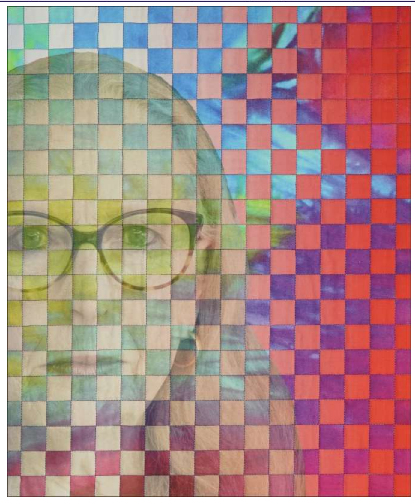
Personal Transparency • 33" x 41" • Copyright © 2023 Caryl Bryer Fallert-Gentry • www.bryerpatch.com

Bryerpatch Studio • 10 Baycliff Pl. • Port Townsend, WA 98368 • caryl @bryerpatch.com • www.bryerpatch.com