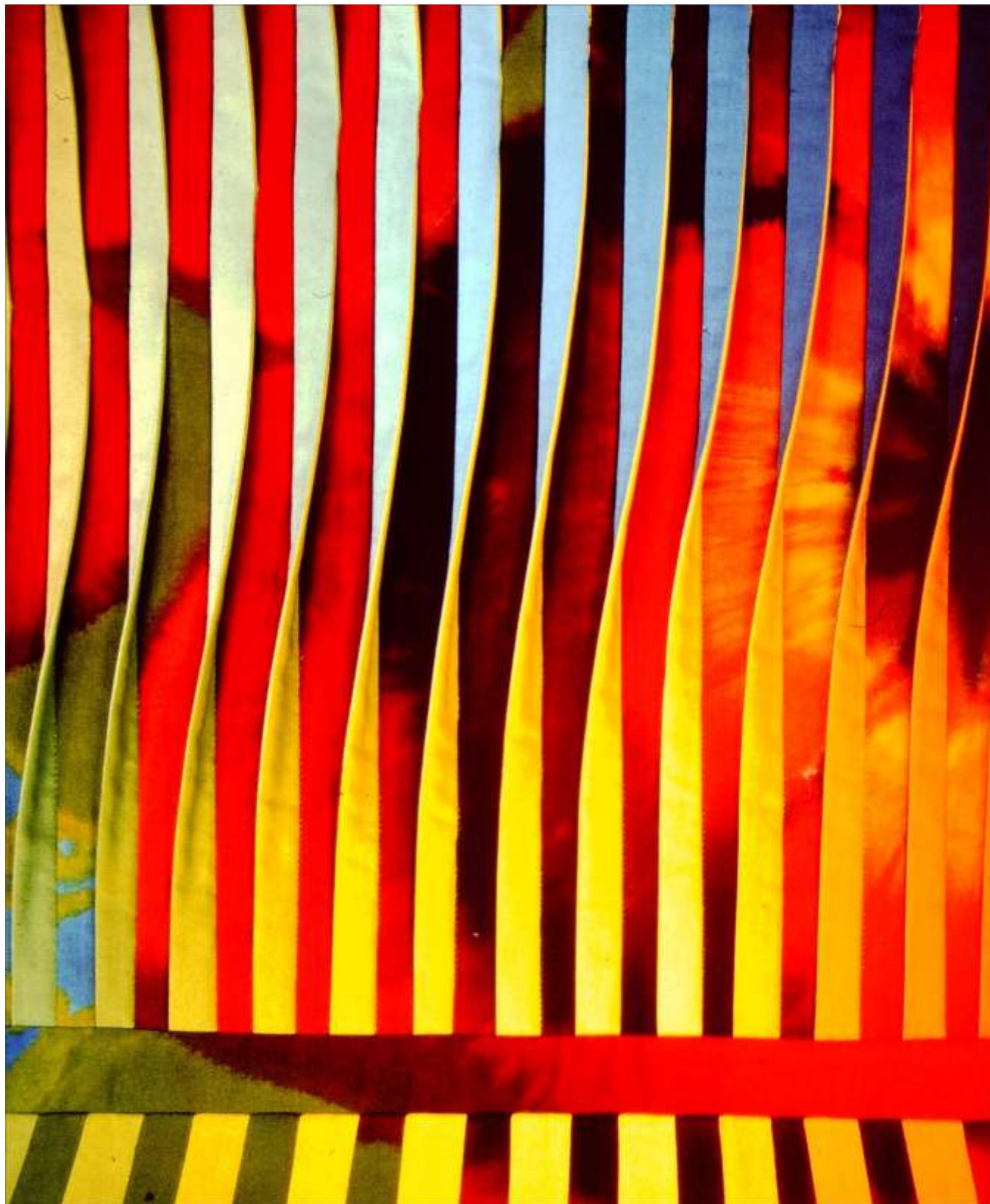
Reflection #16 (detail) • 40" x 48" • Copyright 1991 Caryl Bryer Fallert • Bryerpatch Studio • www.bryerpatch.com

Bryerpatch Studio • 10 Baycliff Pl. • Port Townsend, WA 98368 • caryl@bryerpatch.com • www.bryerpatch.com