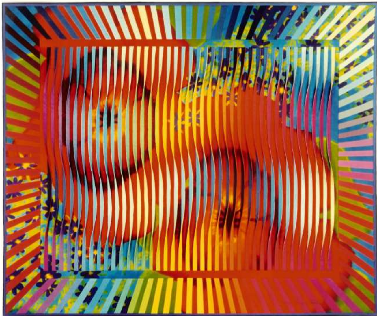
Reflection #16 • 40" x 48" • Copyright 1991 Caryl Bryer Fallert • Bryerpatch Studio • www.bryerpatch.com

Bryerpatch Studio • 10 Baycliff Pl. • Port Townsend, WA 98368 • caryl@bryerpatch.com • www.bryerpatch.com