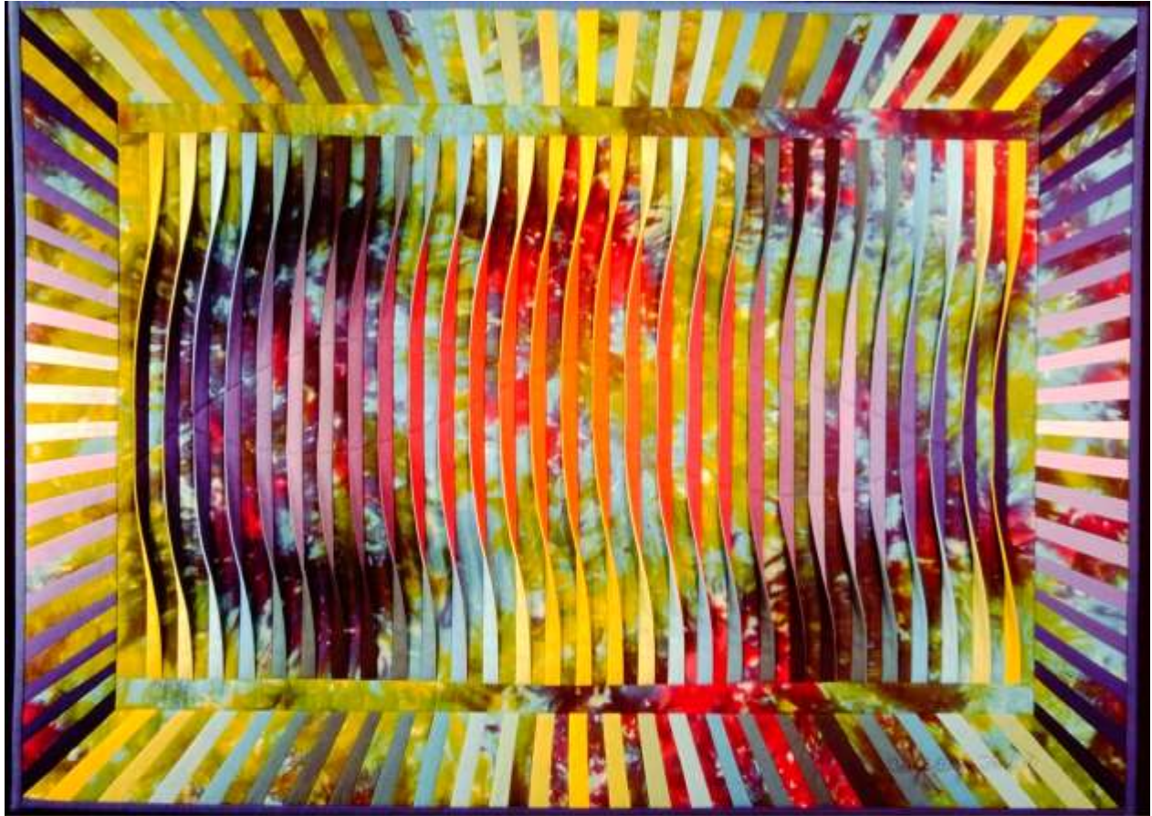
Reflection #26 • 26" x 36" • Copyright © 1992 Caryl Bryer Fallert • www.bryerpatch.com

Bryerpatch Studio • 10 Baycliff Pl. • Port Townsend, WA 98368 • caryl@bryerpatch.com • www.bryerpatch.com