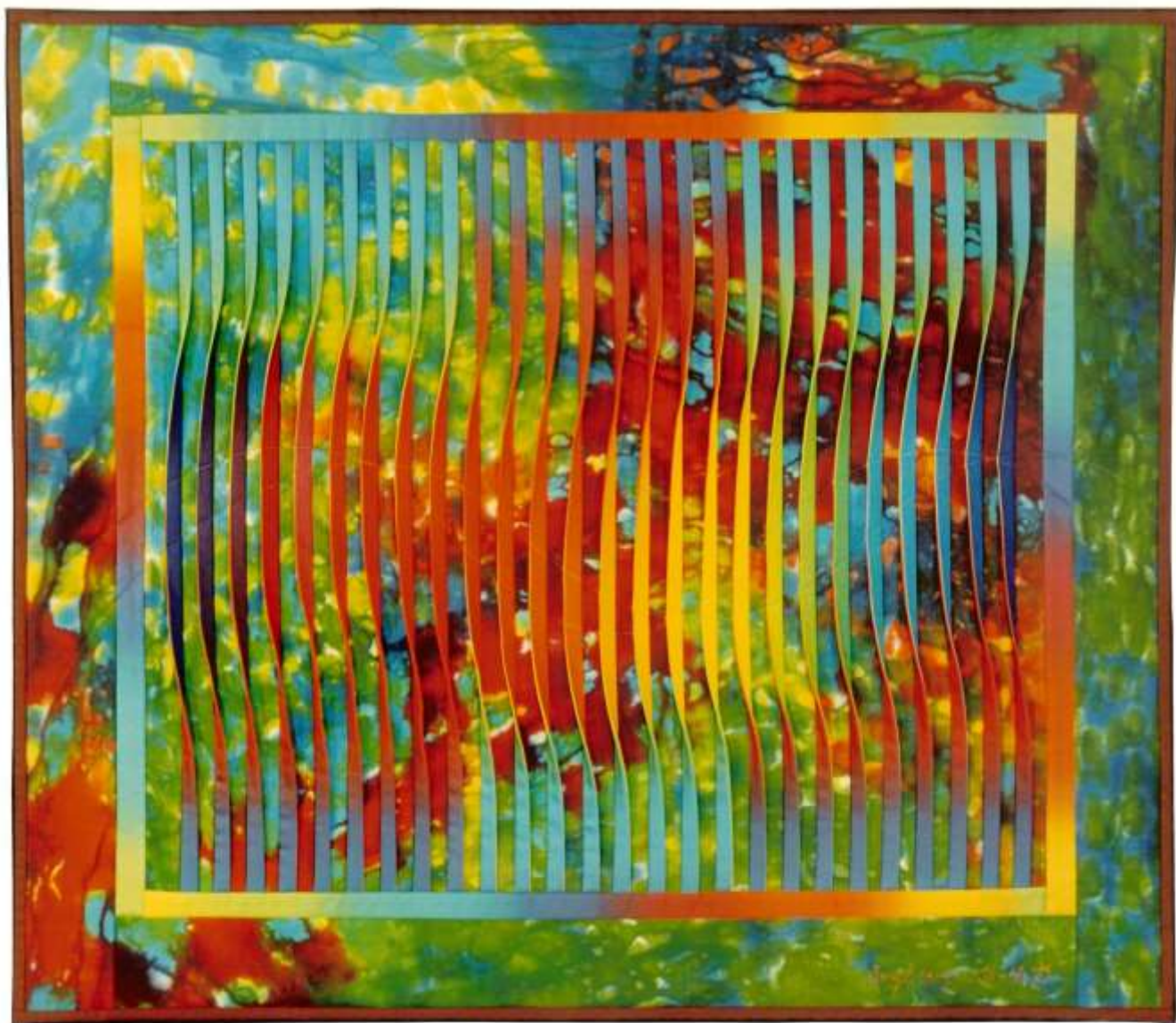
Reflection #36 • 33" x 29" • Copyright © 1994 Caryl Bryer Fallert • Bryerpatch Studio • www.bryerpatch.com

Bryerpatch Studio • 10 Baycliff Pl. • Port Townsend, WA 98368 • caryl@bryerpatch.com • www.bryerpatch.com