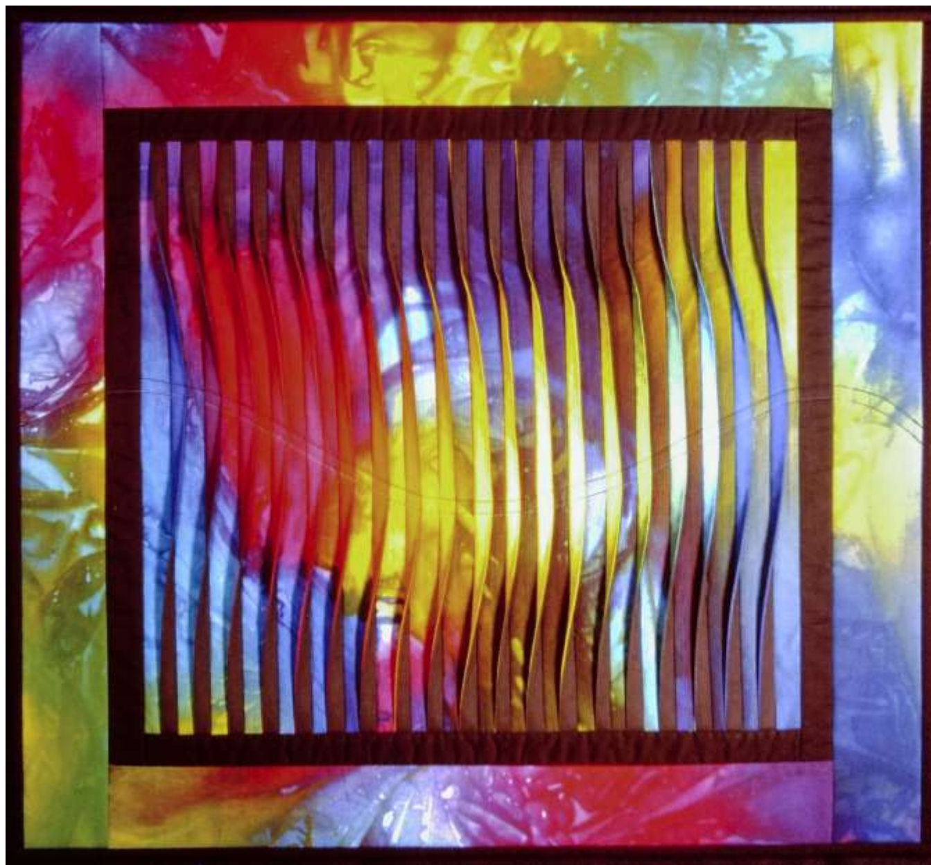
Reflection #49 • 25" x 27" • Copyright © 1997 Caryl Bryer Fallert • Bryerpatch Studio • www.bryerpatch.com

Bryerpatch Studio • 10 Baycliff Pl. • Port Townsend, WA 98368 • caryl@bryerpatch.com • www.bryerpatch.com