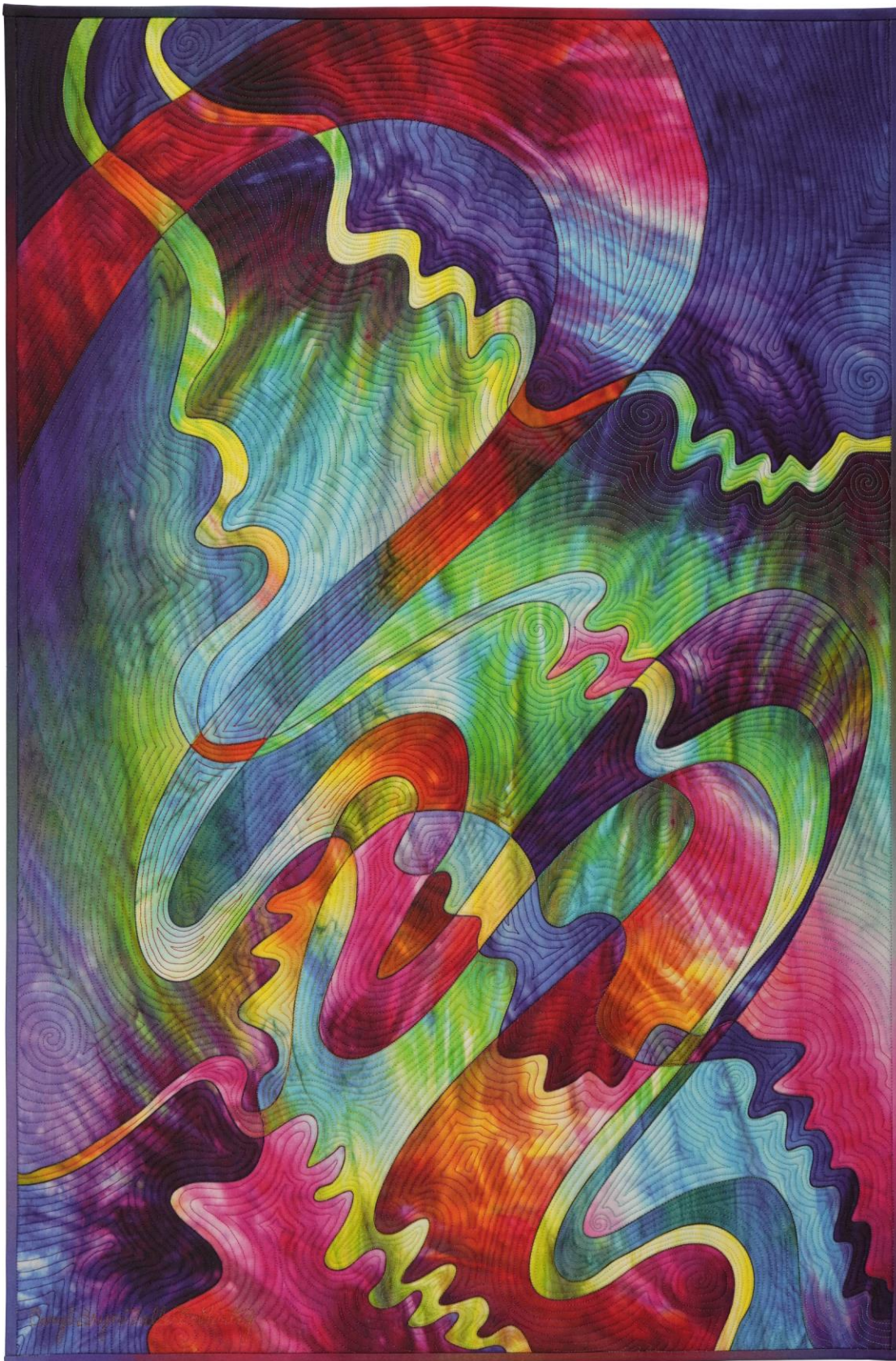
Scribble #1 • 24" x 36.5" • Copyright © 2024 Caryl Bryer Fallert-Gentry • www.bryerpatch.com

Bryerpatch Studio • 10 Baycliff Pl. • Port Townsend, WA 98368 • caryl@bryerpatch.com • www.bryerpatch.com