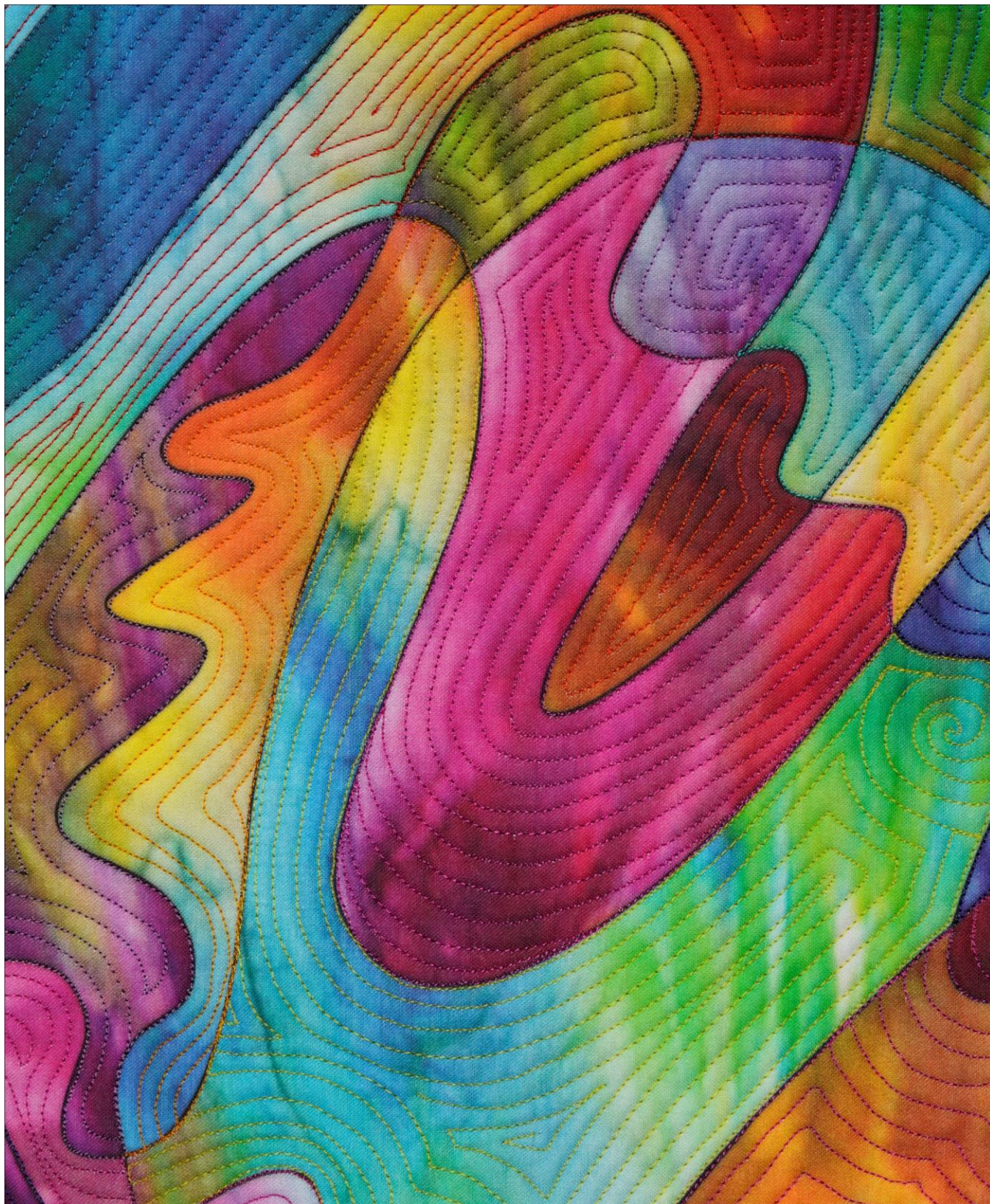
Scribble #1 (detail) • 24" x 36.5" • Copyright © 2024 Caryl Bryer Fallert-Gentry • www.bryerpatch.com