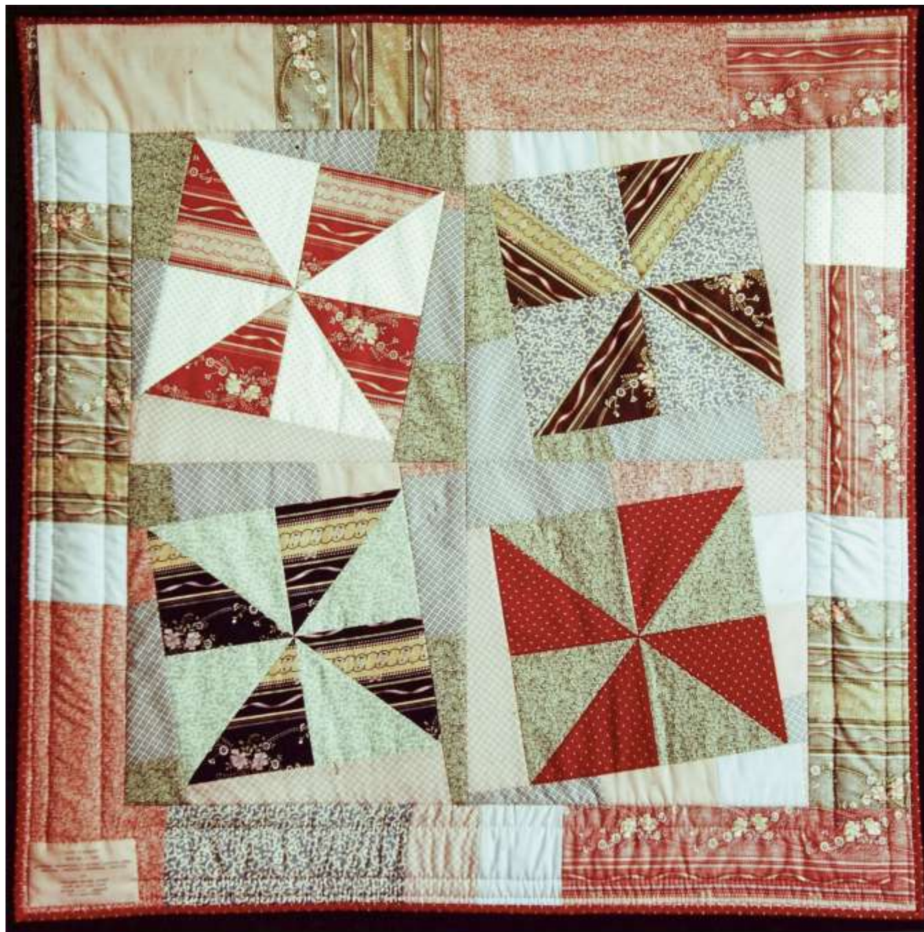
Tuckers Mill (back) • 36" x 36" • Copyright © 1987 Caryl Bryer Fallert • www.bryerpatch.com

Bryerpatch Studio • 10 Baycliff Pl. • Port Townsend, WA 98368 • caryl@bryerpatch.com • www.bryerpatch.com