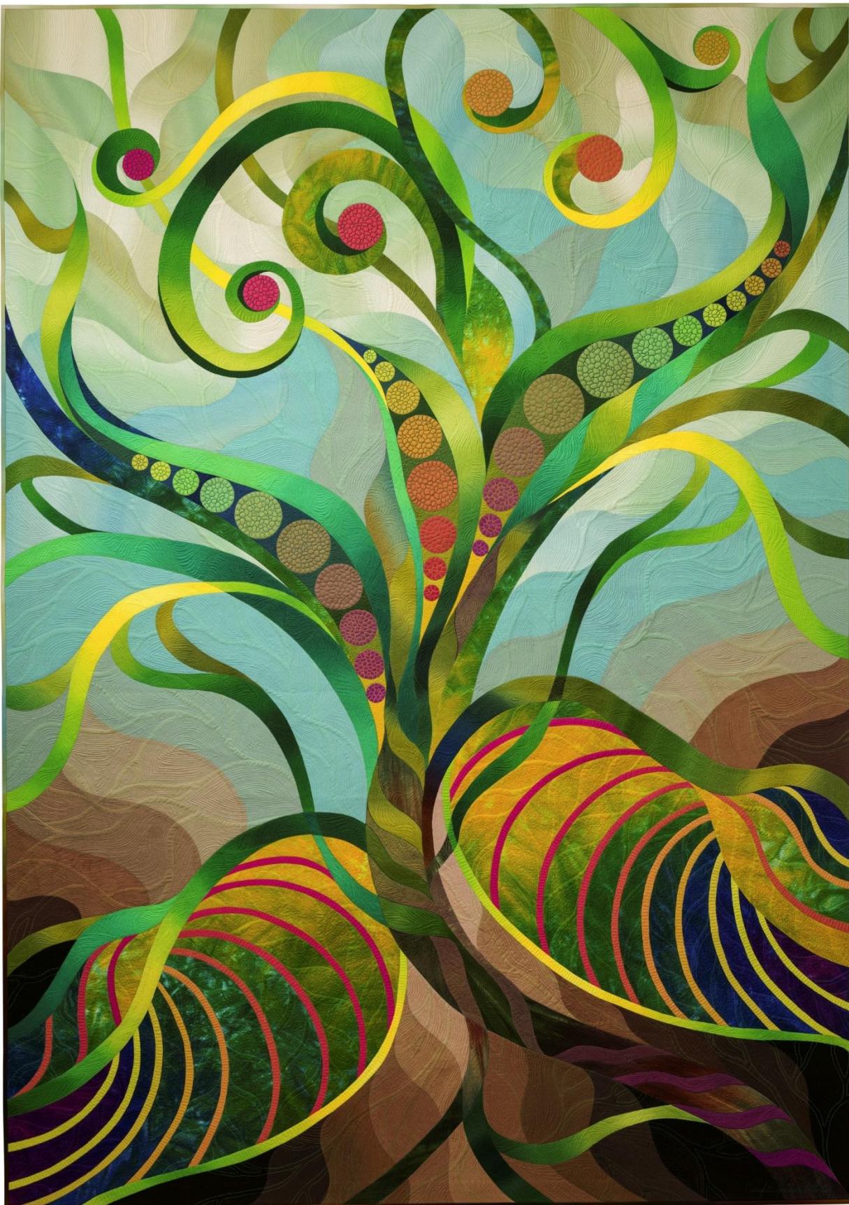
Vine #2 • 61.5" x 86.5" • Copyright 2018 Caryl Bryer Fallert-Gentry • www.bryerpatch.com