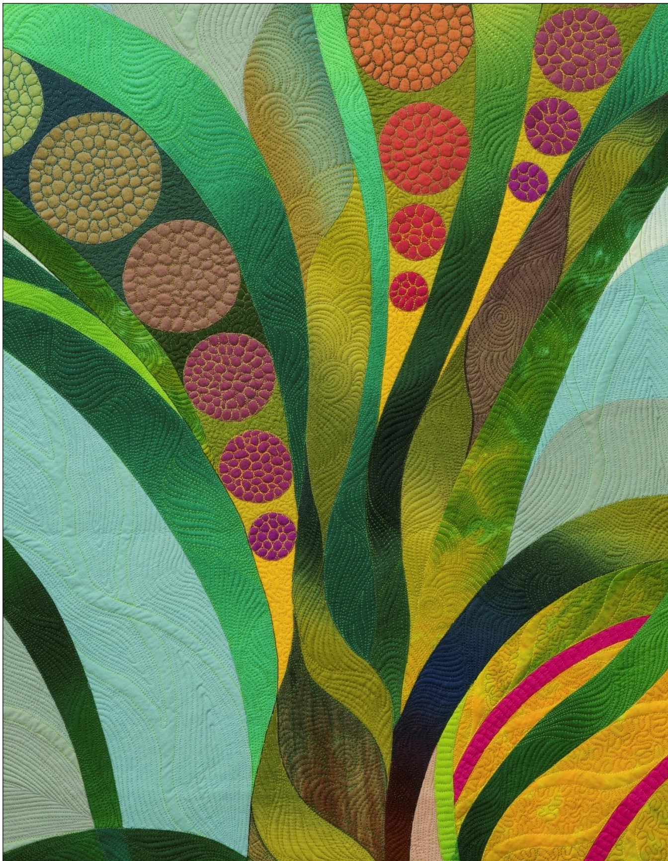
Vine #2 (detail) • 61.5" x 86.5" • Copyright 2018 Caryl Bryer Fallert-Gentry • www.bryerpatch.com