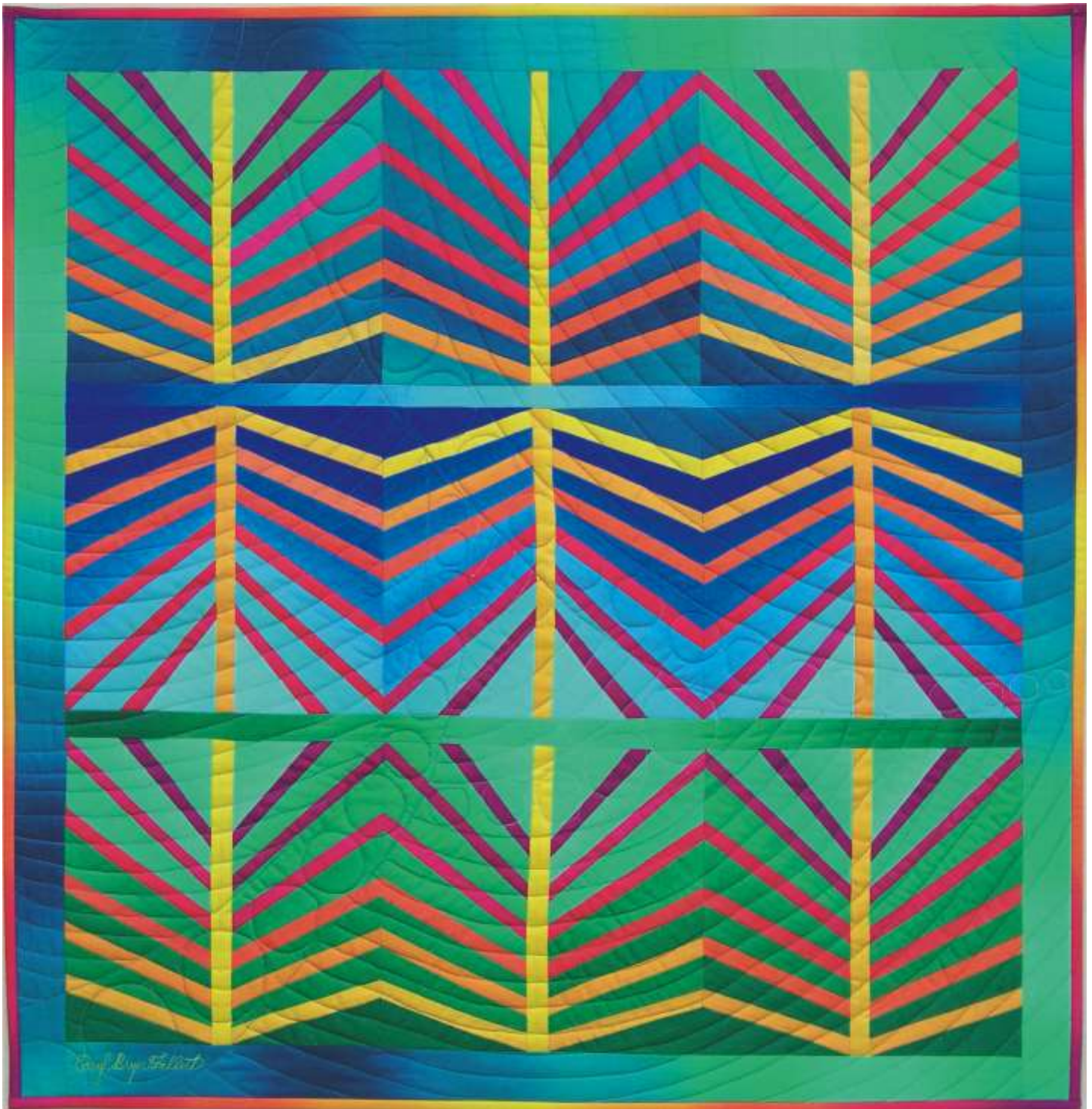
Zigzag #1 • 29" x 29" © 2006 Caryl Bryer Fallert • Bryerpatch Studio • www.bryerpatch.com

Bryerpatch Studio • 10 Baycliff Pl. • Port Townsend, WA 98368 • caryl@bryerpatch.com • www.bryerpatch.com