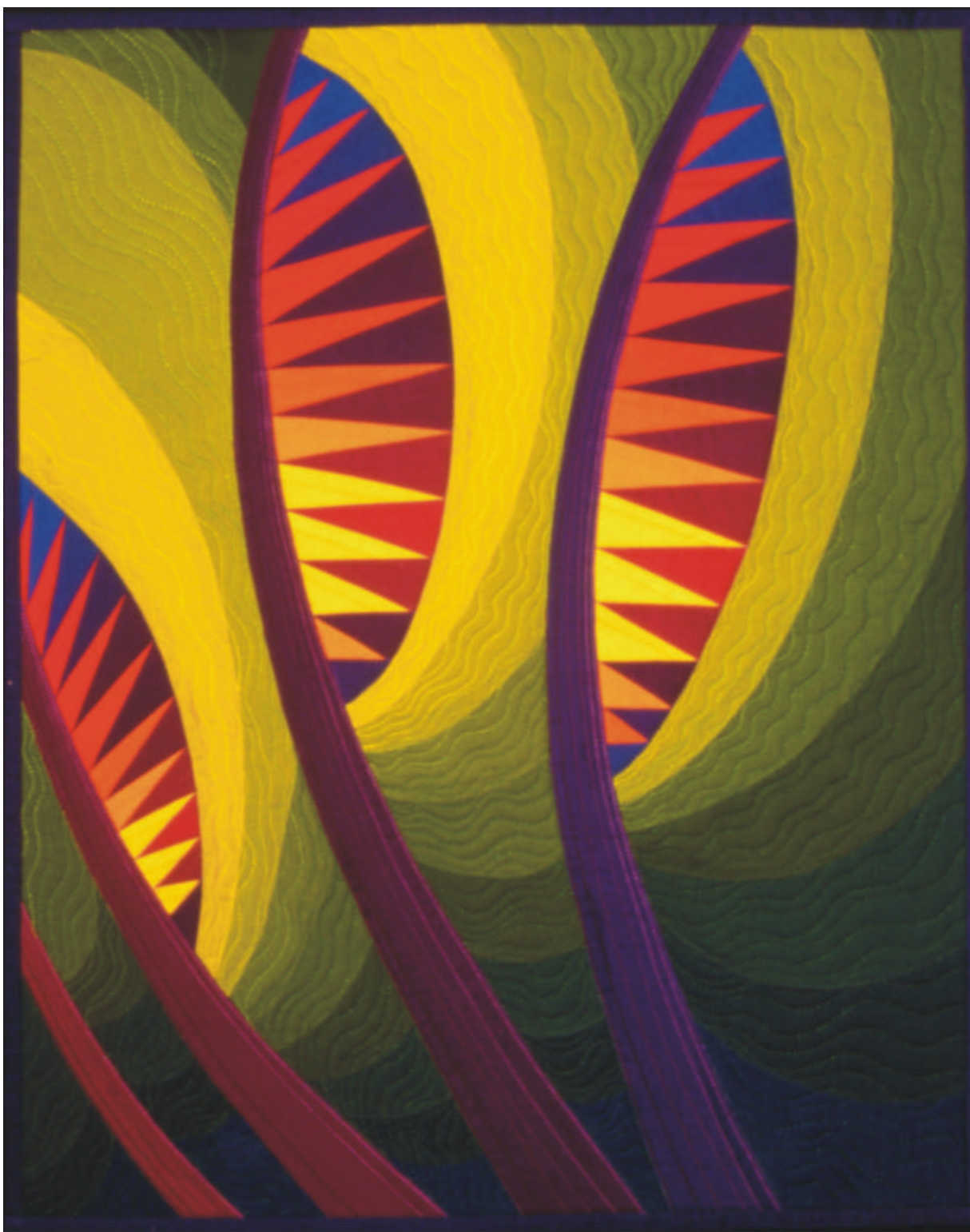
Feather Study #13 • 18" x 22" Copyright © 1999 • Caryl Bryer Fallert • Bryerpatch Studio • www.bryerpatch.com