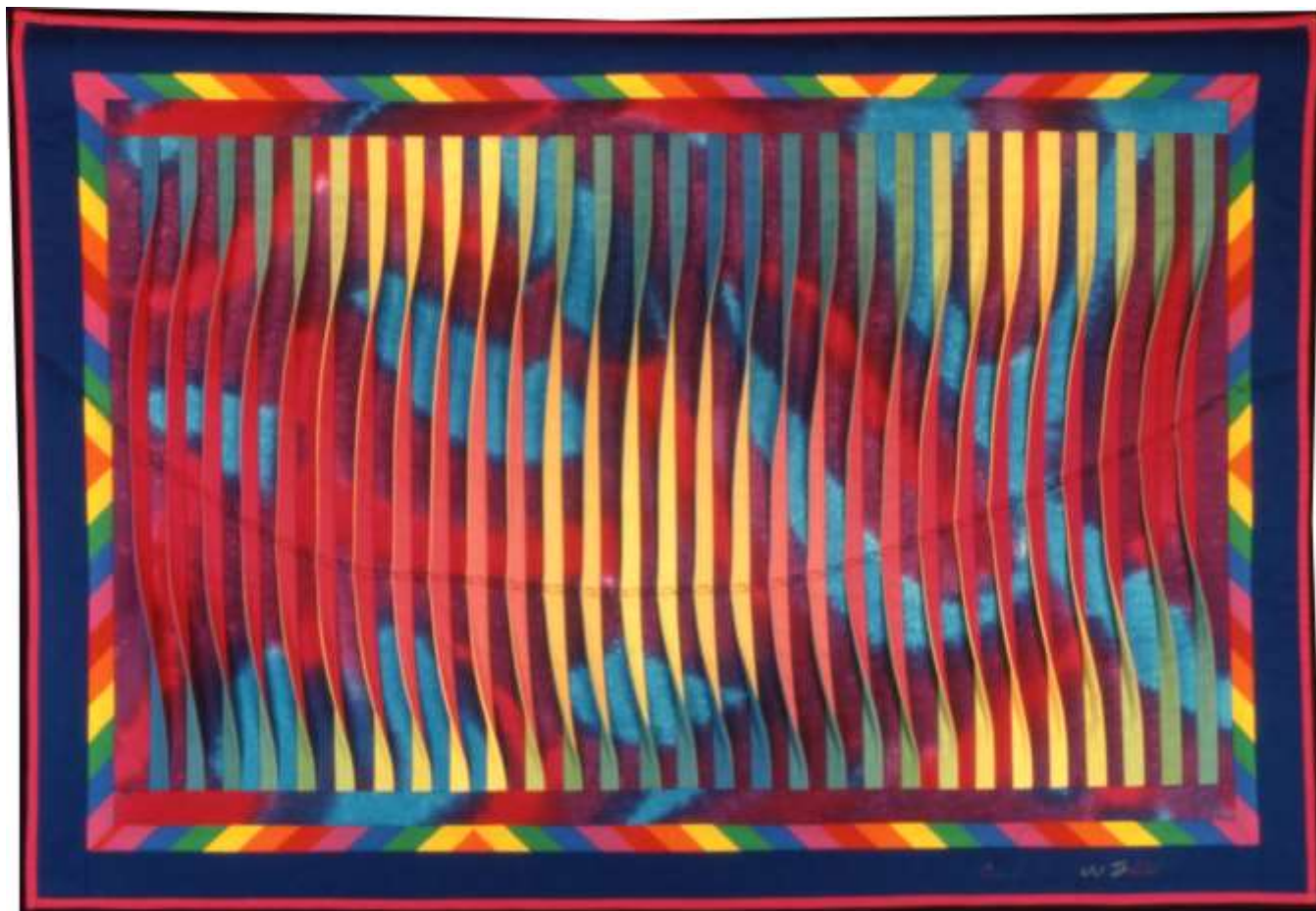
High Tech Tucks #19 • 24" x 34" • Copyright © Caryl Bryer Fallert • www.bryerpatch.com