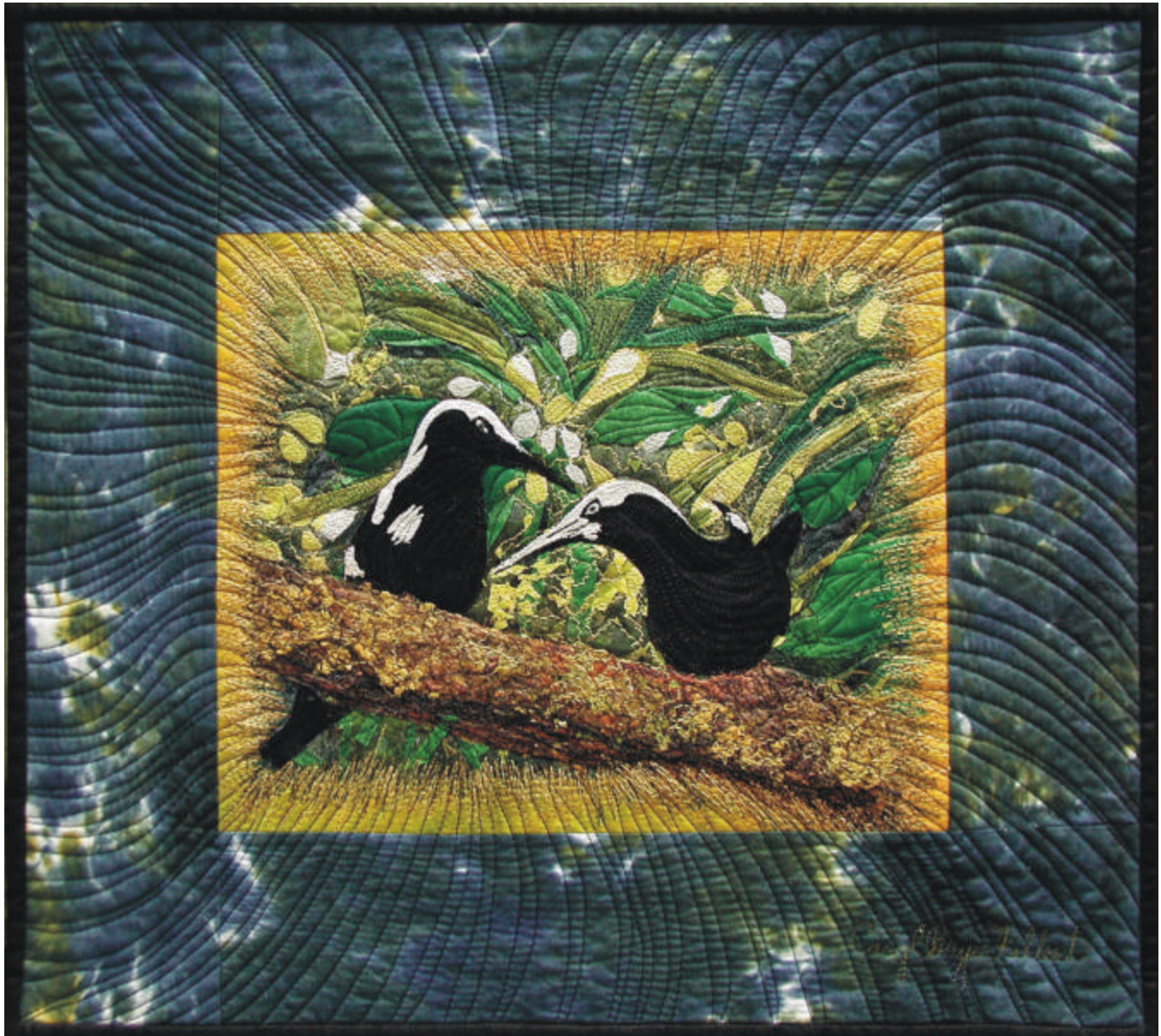
Noddy Terns • 17" x 19" • Copyright© 2000 Caryl Bryer Fallert • Bryerpatch Studio • www.bryerpatch.com