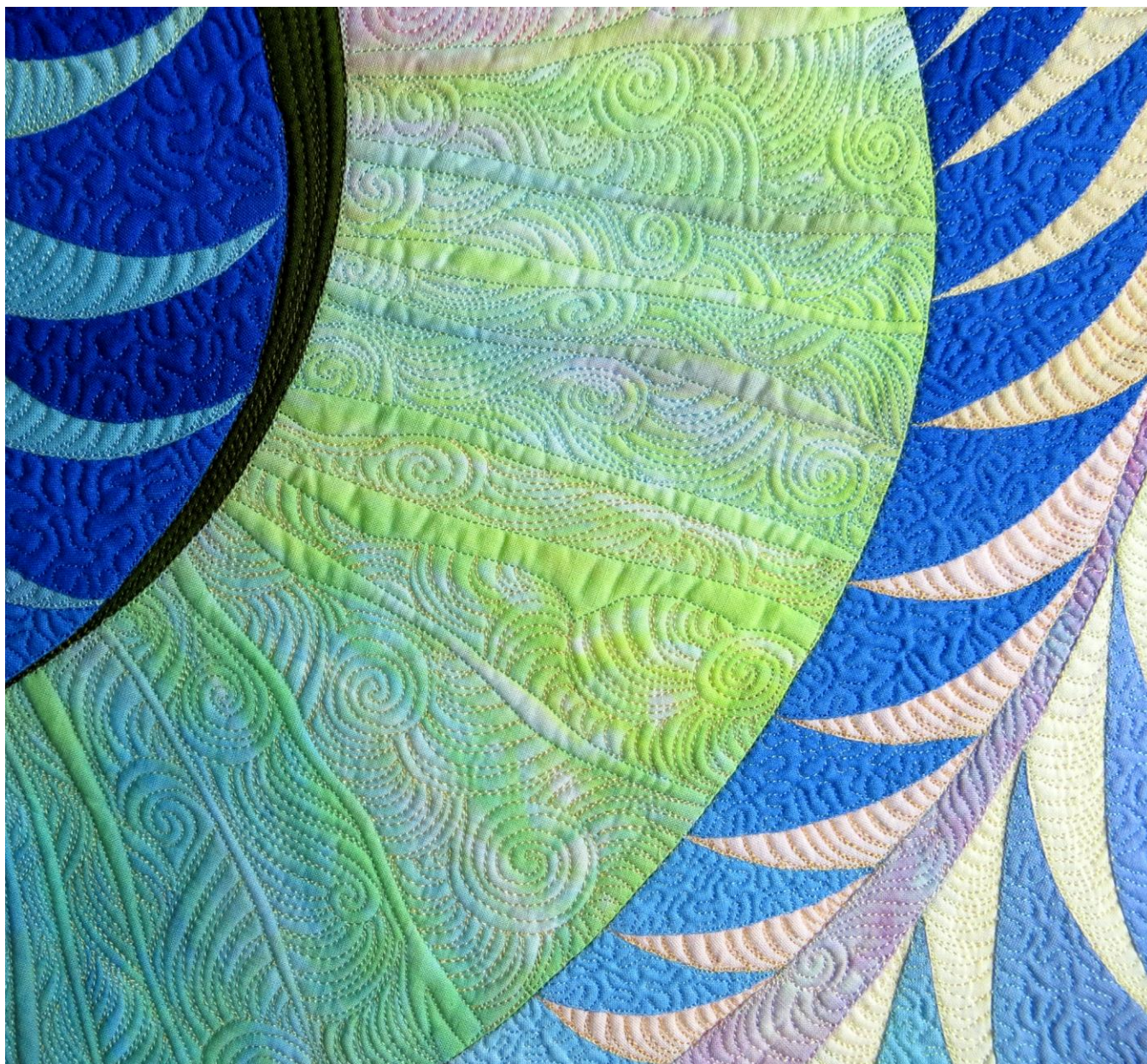
Cosmic Feathers #1 (detail) • 30" x 30" • Copyright © 2013 Caryl Bryer Fallert-Gentry