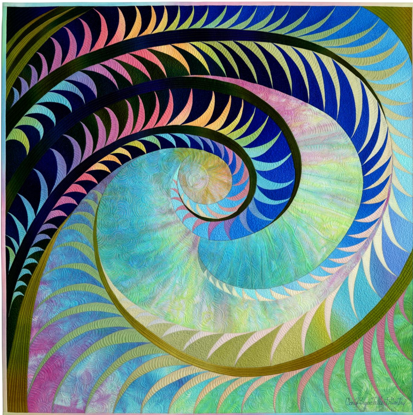
Cosmic Feathers #1 • 30" x 30" • Copyright © 2013 Caryl Bryer Fallert-Gentry • Bryerpatch Studio • www.bryerpatch.com

Bryerpatch Studio • 10 Baycliff Pl. • Port Townsend, WA 98368 • caryl@bryerpatch.com • www.bryerpatch.com