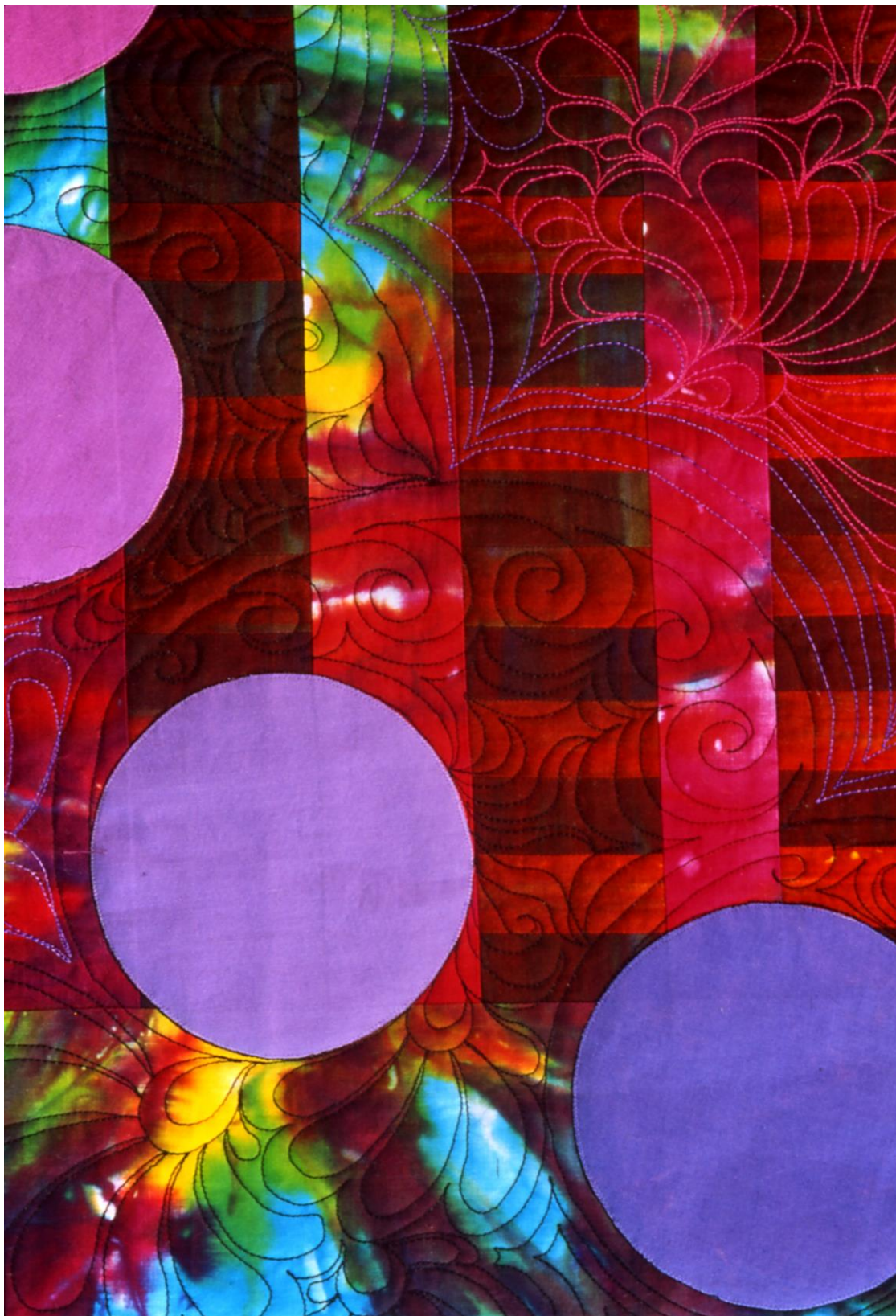
Fibonacci's Garden (detail) • 71" x 54" • Copyright © 1995 Caryl Bryer Fallert • Bryerpatch Studio • www.bryerpatch.com

Bryerpatch Studio • 10 Baycliff Pl. • Port Townsend, WA 98368 • caryl@bryerpatch.com • www.bryerpatch.com