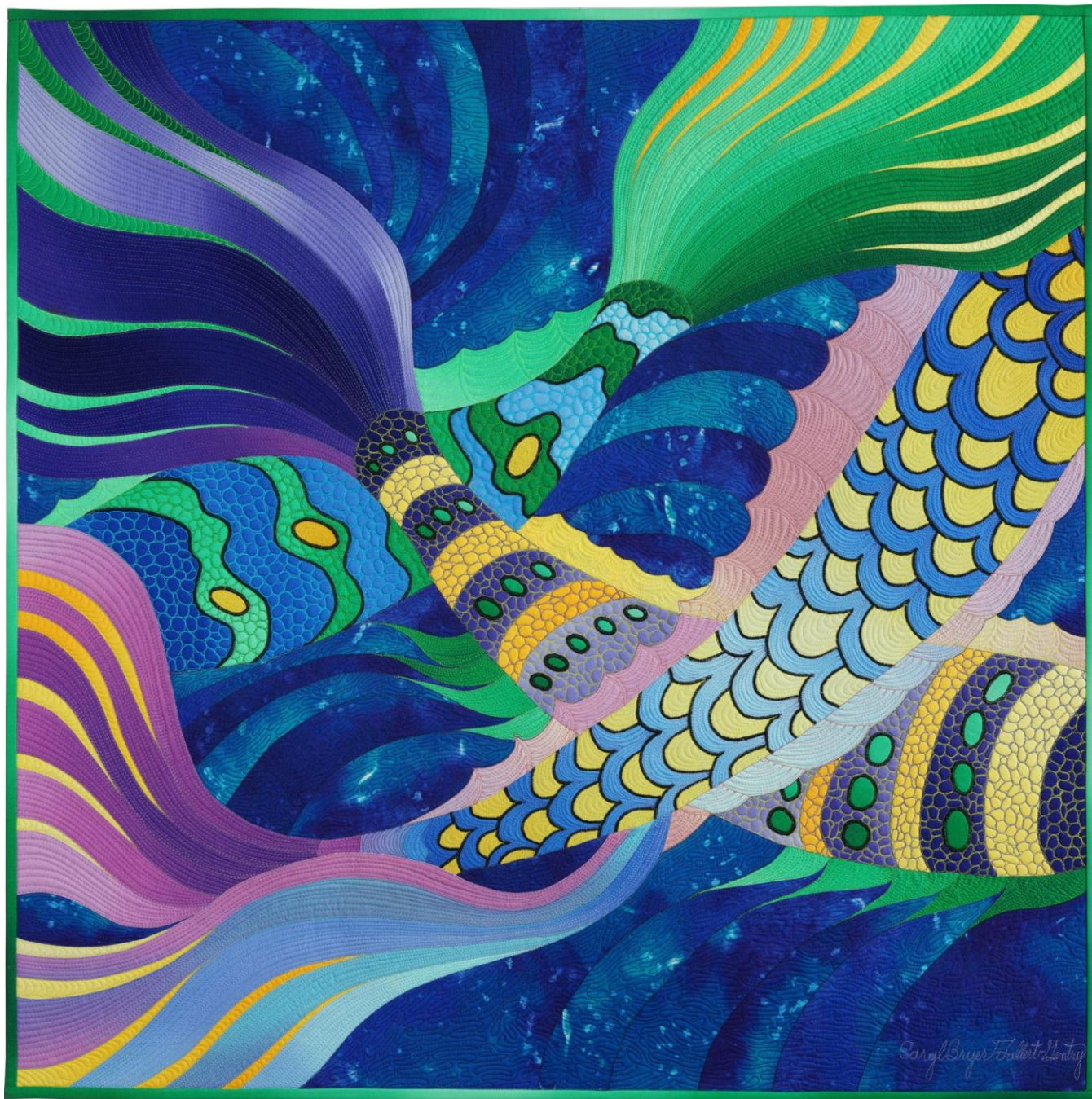
Aquarium #2 • 30" x 30" • Copyright © 2014 Caryl Bryer Fallert-Gentry • Bryerpatch Studio • www.bryerpatch.com

Bryerpatch Studio • 10 Baycliff Pl. • Port Townsend, WA 98368 • caryl@bryerpatch.com • www.bryerpatch.com