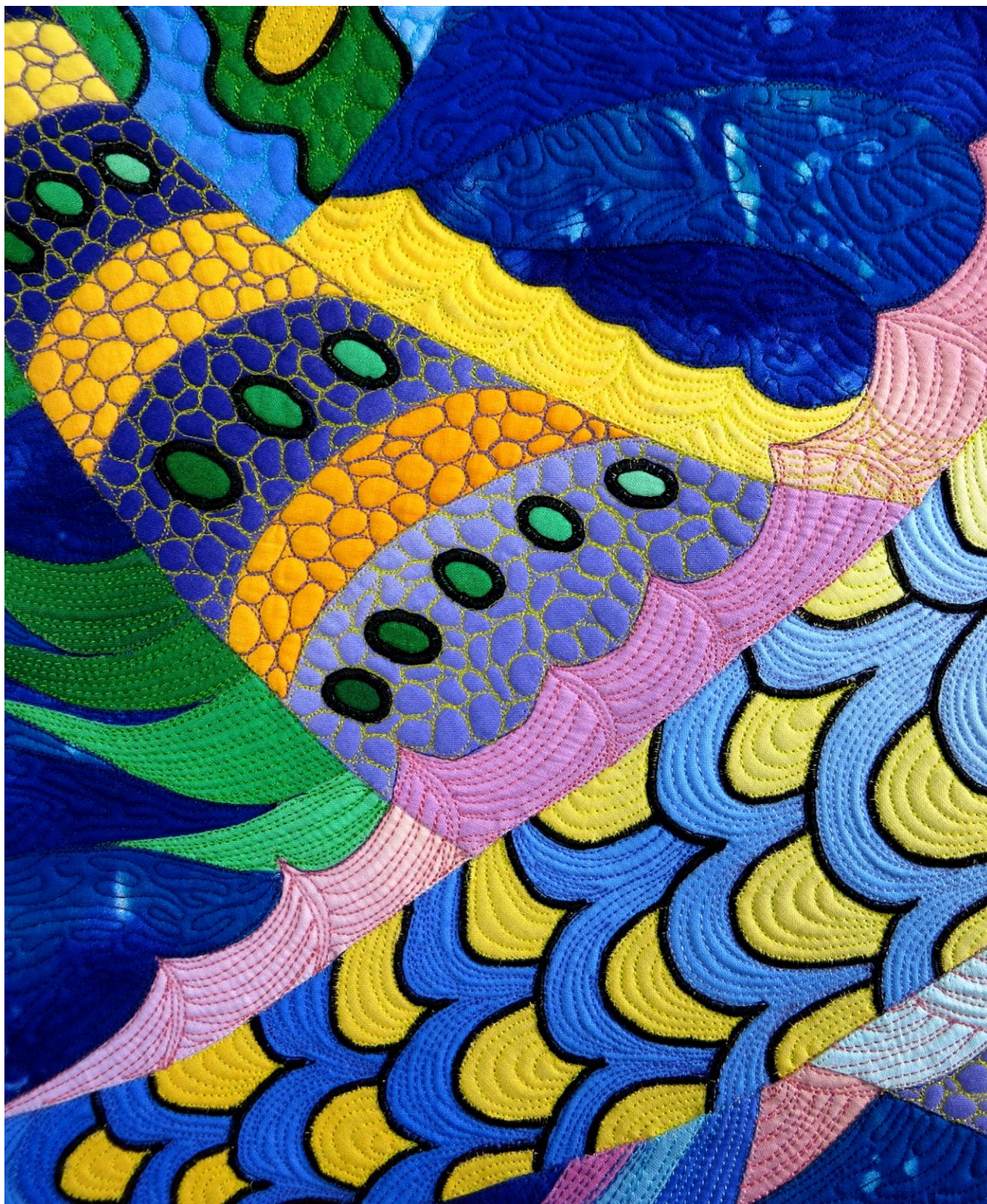
Aquarium #2 (detail) • 30" x 30" • Copyright © 2014 Caryl Bryer Fallert-Gentry • Bryerpatch Studio • www.bryerpatch.com

Bryerpatch Studio • 10 Baycliff Pl. • Port Townsend, WA 98368 • caryl@bryerpatch.com • www.bryerpatch.com