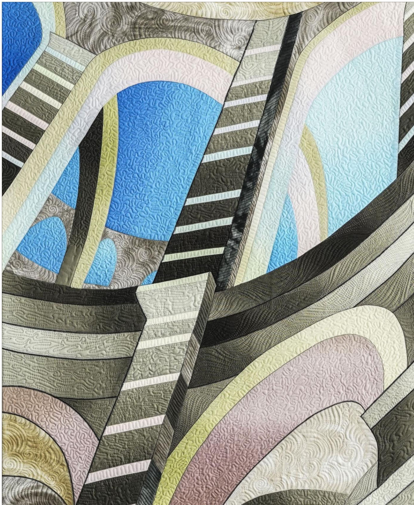
Arches • 44" x 44" • Copyright © 2017 Caryl Bryer Fallert-Gentry • Bryerpatch Studio • www.bryerpatch.com