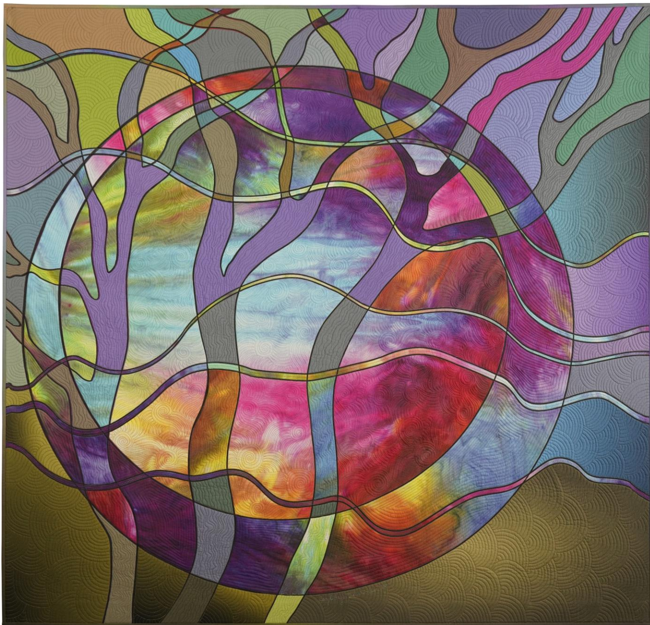
Branches #1 • 52.5" x 50.5" • Copyright © 2024 Caryl Bryer Fallert-Gentry • www.bryerpatch.com

Bryerpatch Studio • 10 Baycliff Pl. • Port Townsend, WA 98368 • caryl@bryerpatch.com • www.bryerpatch.com