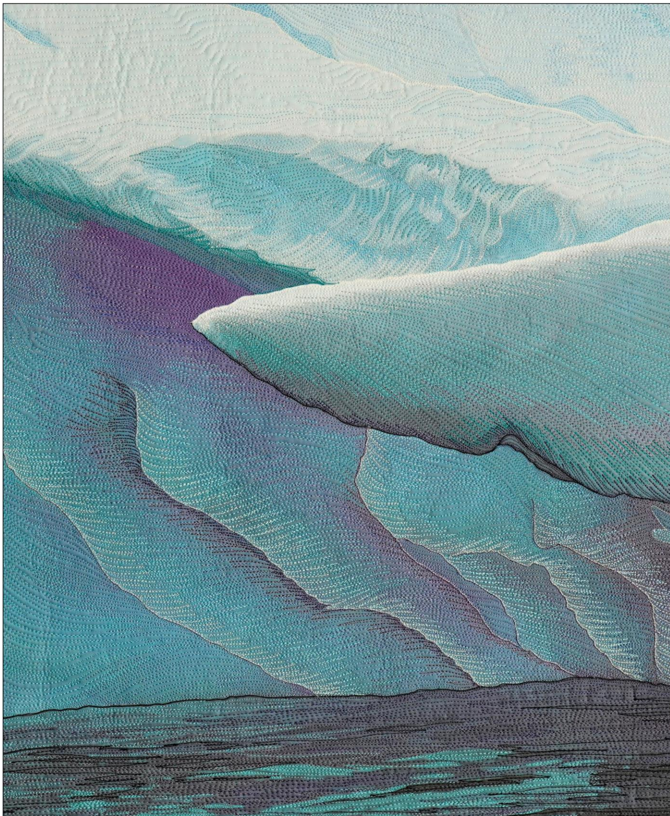
Nice Ice #2 (detail) • 30" x 30" • Copyright © 2020 Caryl Bryer Fallert-Gentry • www.bryerpatch.com