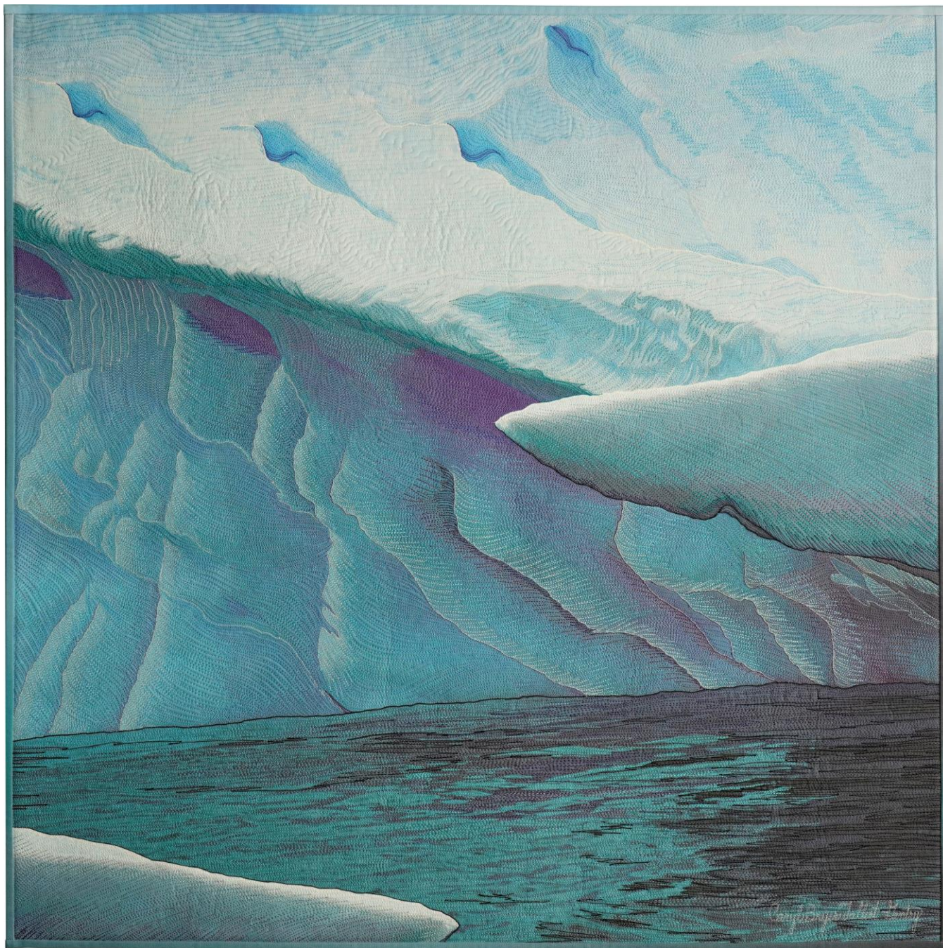
Nice Ice #2 • 30" x 30" • Copyright © 2020 Caryl Bryer Fallert-Gentry • www.bryerpatch.com