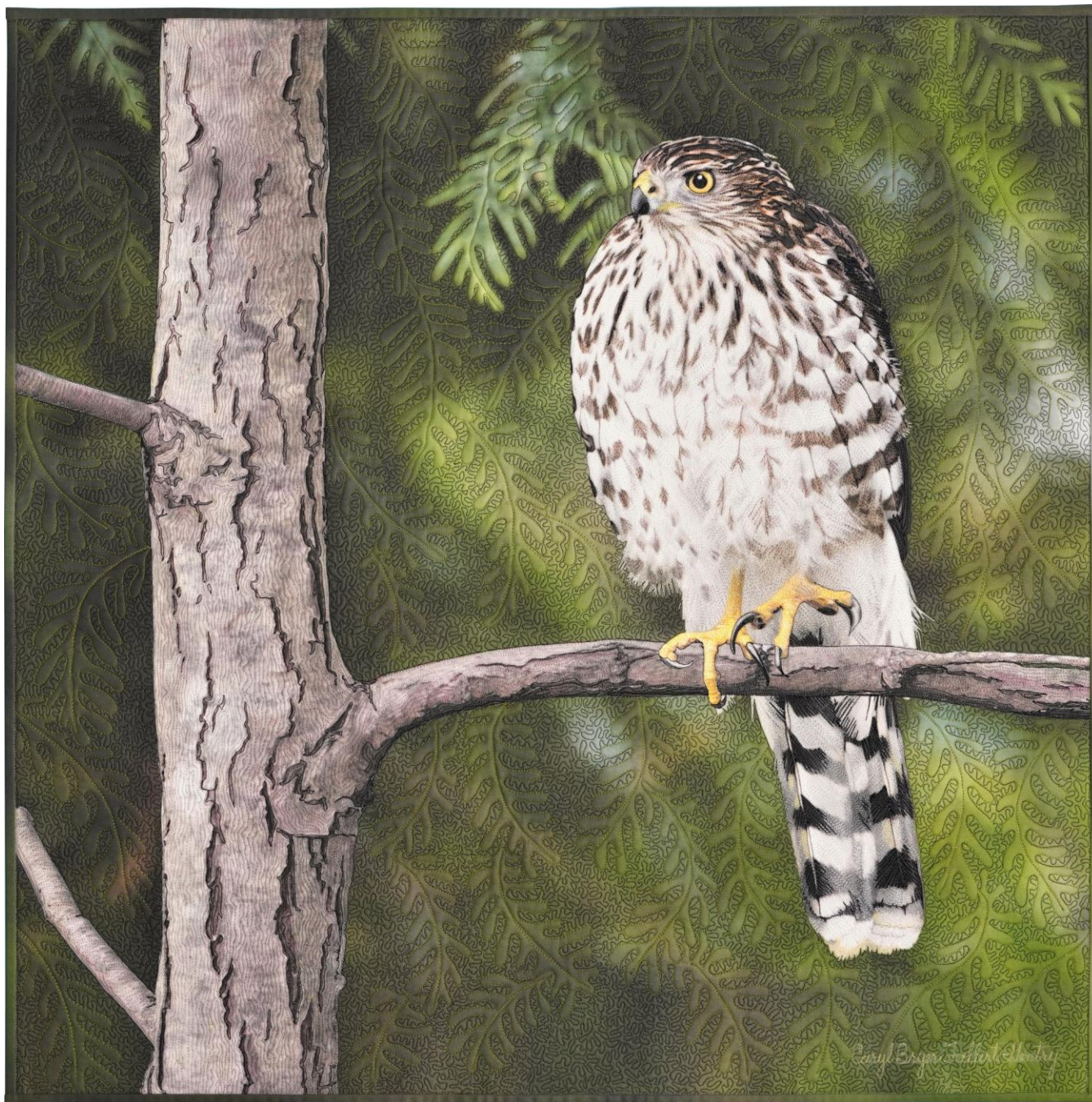
Northern Harrier • 30" x 30" • Copyright © 2020 Caryl Bryer Fallert-Gentry • www.bryerpatch.com