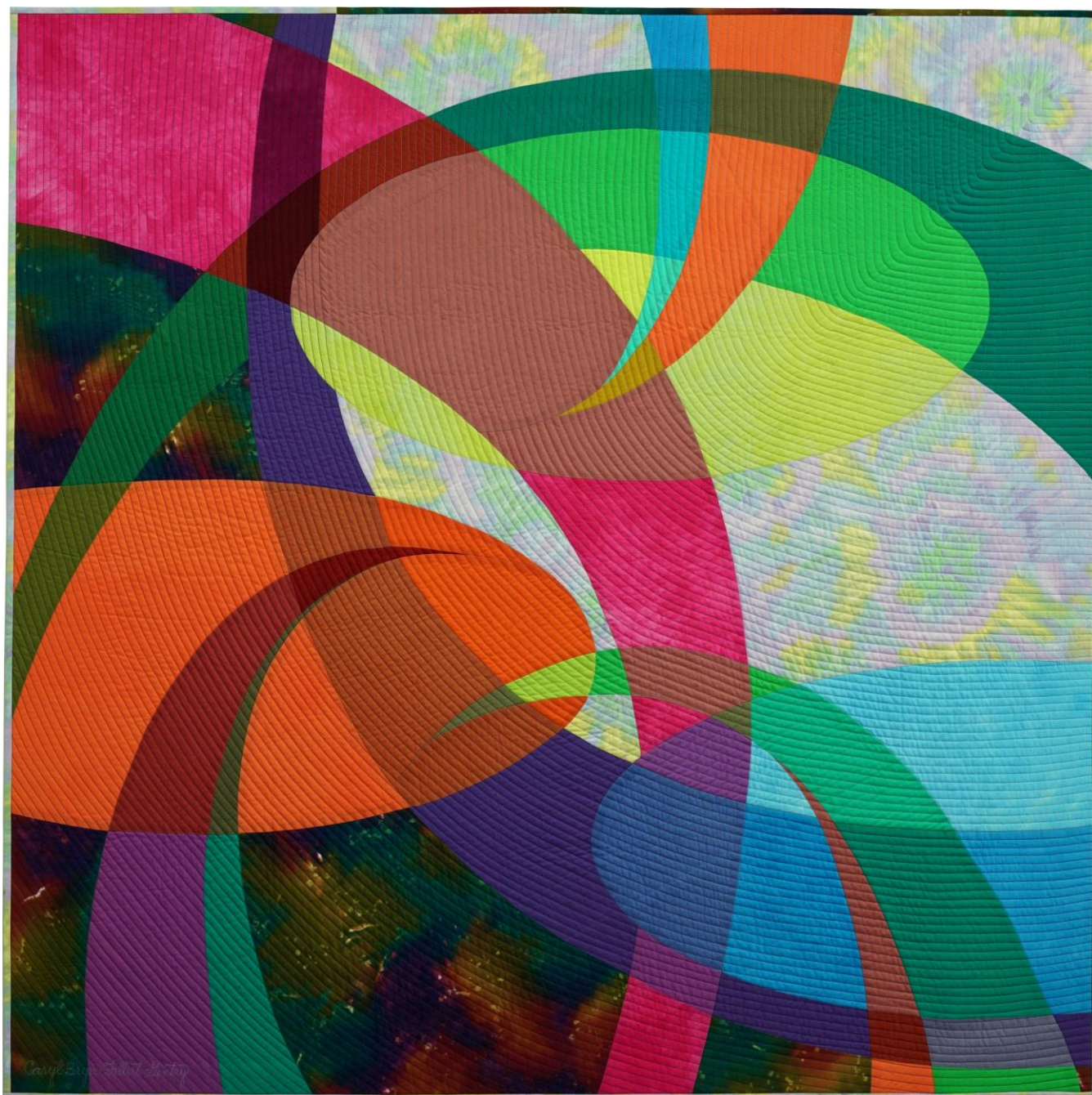
Parabollipses • 49" x 49" • Copyright © 2016 • Caryl Bryer Fallert-Gentry • Bryerpatch Studio • www.bryerpatch.com

Bryerpatch Studio • 10 Baycliff Pl. • Port Townsend, WA 98368 • caryl@bryerpatch.com • www.bryerpatch.com