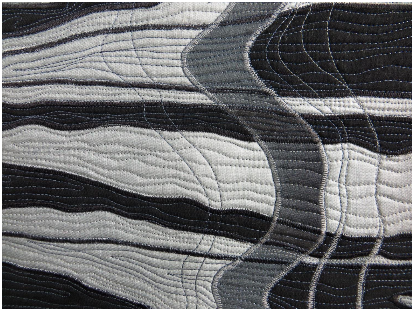
Reflections of Cowichan #1 (detail) • 30" x 30" • Copyright © 2015 Caryl Bryer Fallert-Gentry