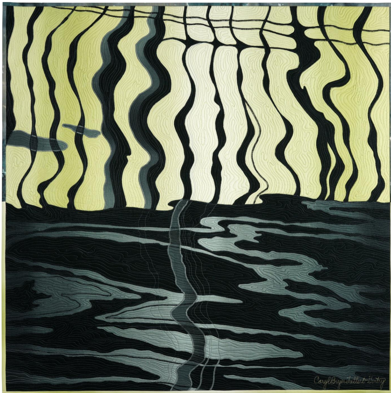
Reflections of Cowichan #1 • 30" x 30" • Copyright © 2015 Caryl Bryer Fallert-Gentry • Bryerpatch Studio • www.bryerpatch.com

Bryerpatch Studio • 10 Baycliff Pl. • Port Townsend, WA 98368 • caryl@bryerpatch.com • www.bryerpatch.com