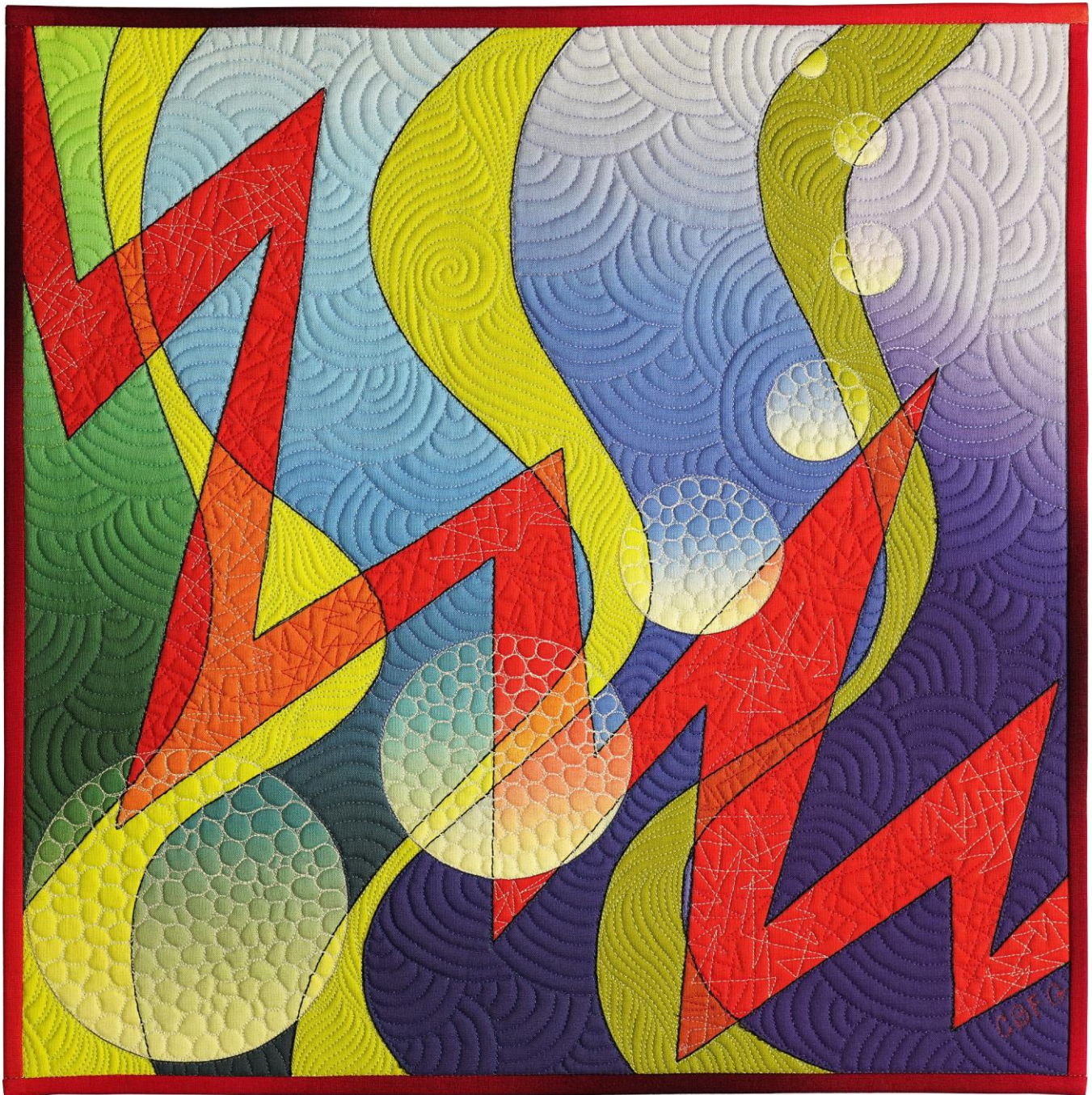
Through Thick & Thin #6 • 16" x 16" • Copyright © 2026 Caryl Bryer Fallert-Gentry • www.bryerpatch.com