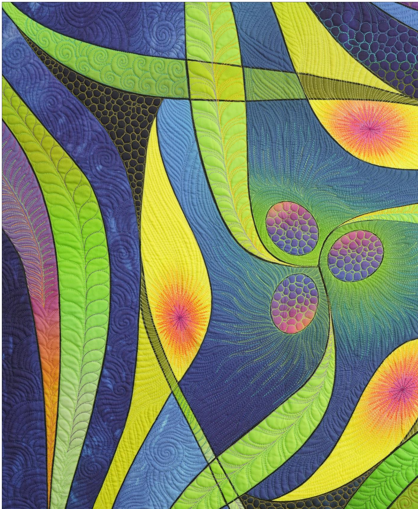
Tricuspid Biomorph #2 (detail) • 64" x 80" • Copyright © 2025 Caryl Bryer Fallert-Gentry • www.bryerpatch.com