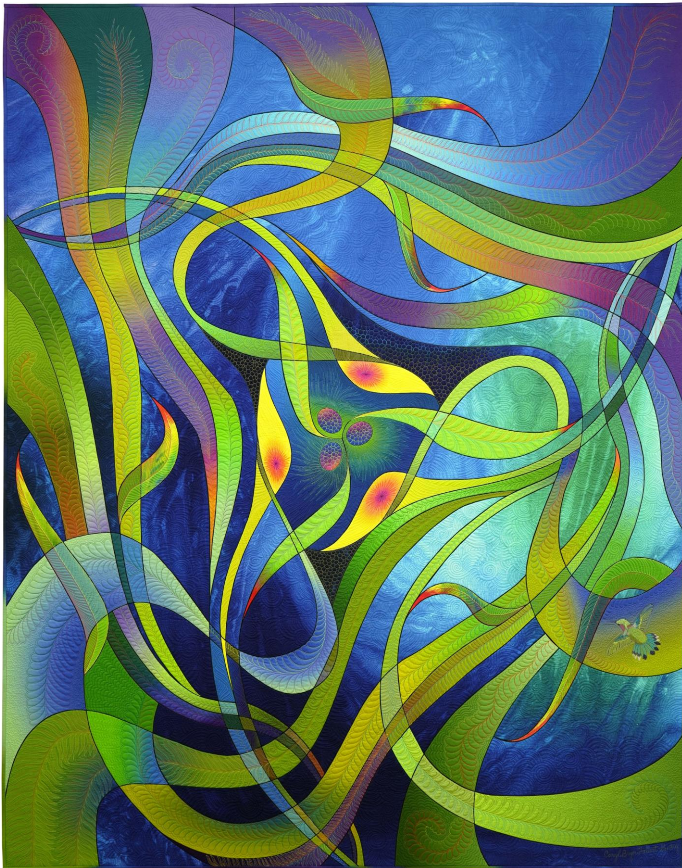
Tricuspid Biomorph #2 • 64" x 80" • Copyright © 2025 Caryl Bryer Fallert-Gentry • www.bryerpatch.com

Bryerpatch Studio • 10 Baycliff Pl. • Port Townsend, WA 98368 • caryl@bryerpatch.com • www.bryerpatch.com