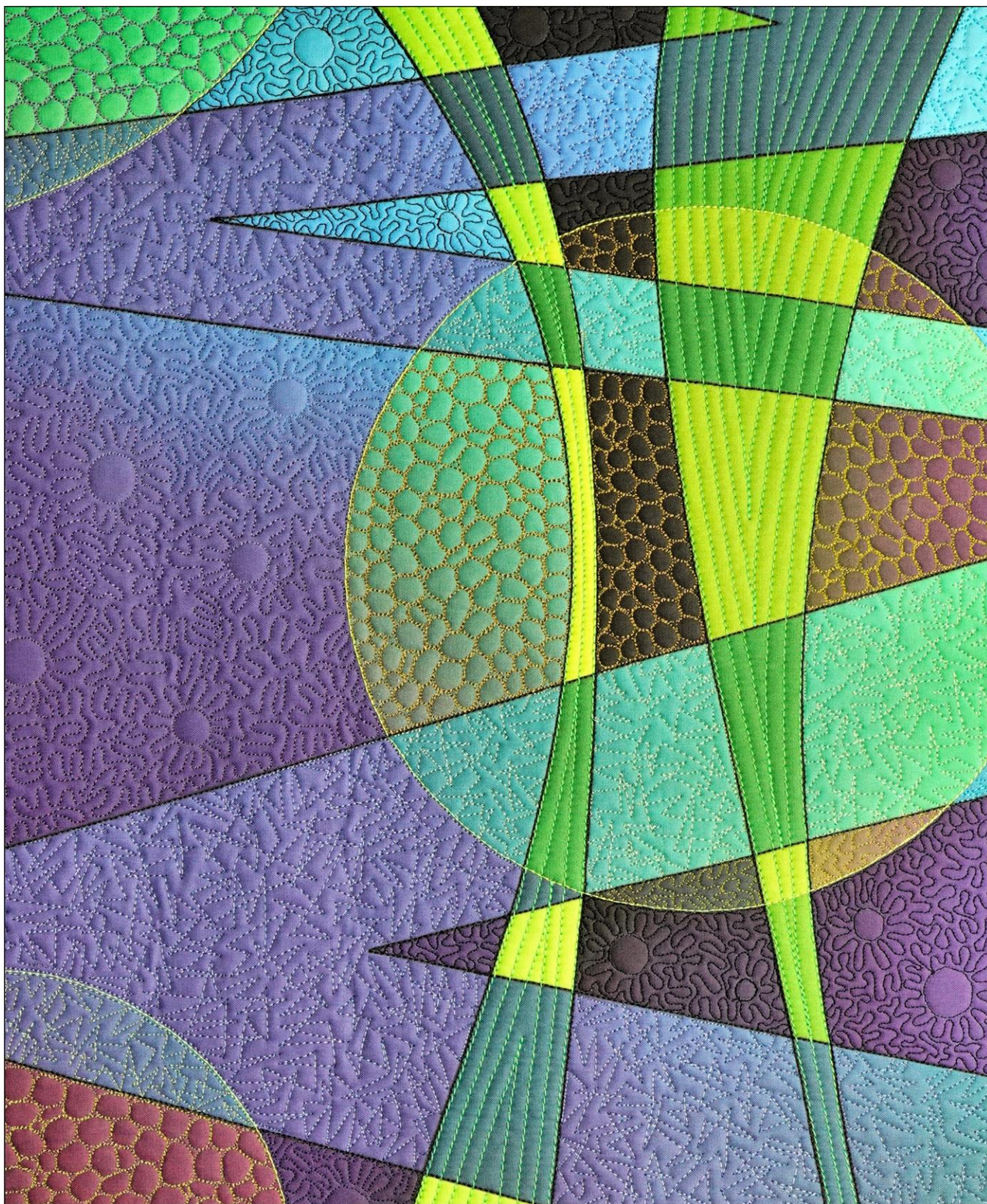
Zigzags & Circles #3 (detail) • 24" x 39" • Copyright © 2021 Caryl Bryer Fallert-Gentry • www.bryerpatch.com

Bryerpatch Studio • 10 Baycliff Pl. • Port Townsend, WA 98368 • caryl@bryerpatch.com • www.bryerpatch.com