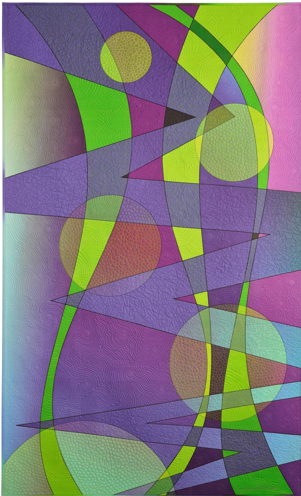
Zigzags & Circles #5 • 41" x 67" • Copyright © 2021 Caryl Bryer Fallert-Gentry • www.bryerpatch.com

Bryerpatch Studio • 10 Baycliff Pl. • Port Townsend, WA 98368 • caryl@bryerpatch.com • www.bryerpatch.com