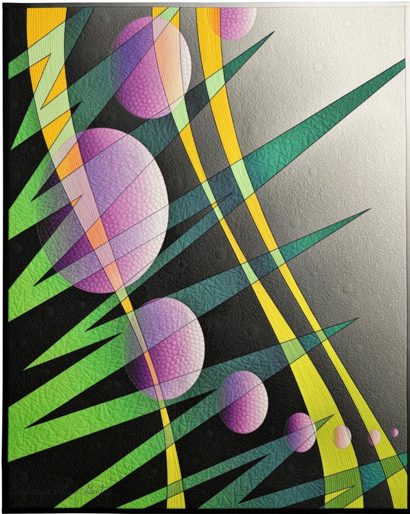
Zigzags & Ellipses #2 • 24" x 30" • Copyright © 2021 Caryl Bryer Fallert-Gentry • www.bryerpatch.com

Bryerpatch Studio • 10 Baycliff Pl. • Port Townsend, WA 98368 • caryl@bryerpatch.com • www.bryerpatch.com